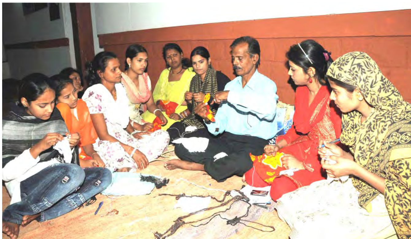
Women Beneficiaries during Training Programme

Presently, NSKFDC is giving preference to greater coverage of women beneficiaries under