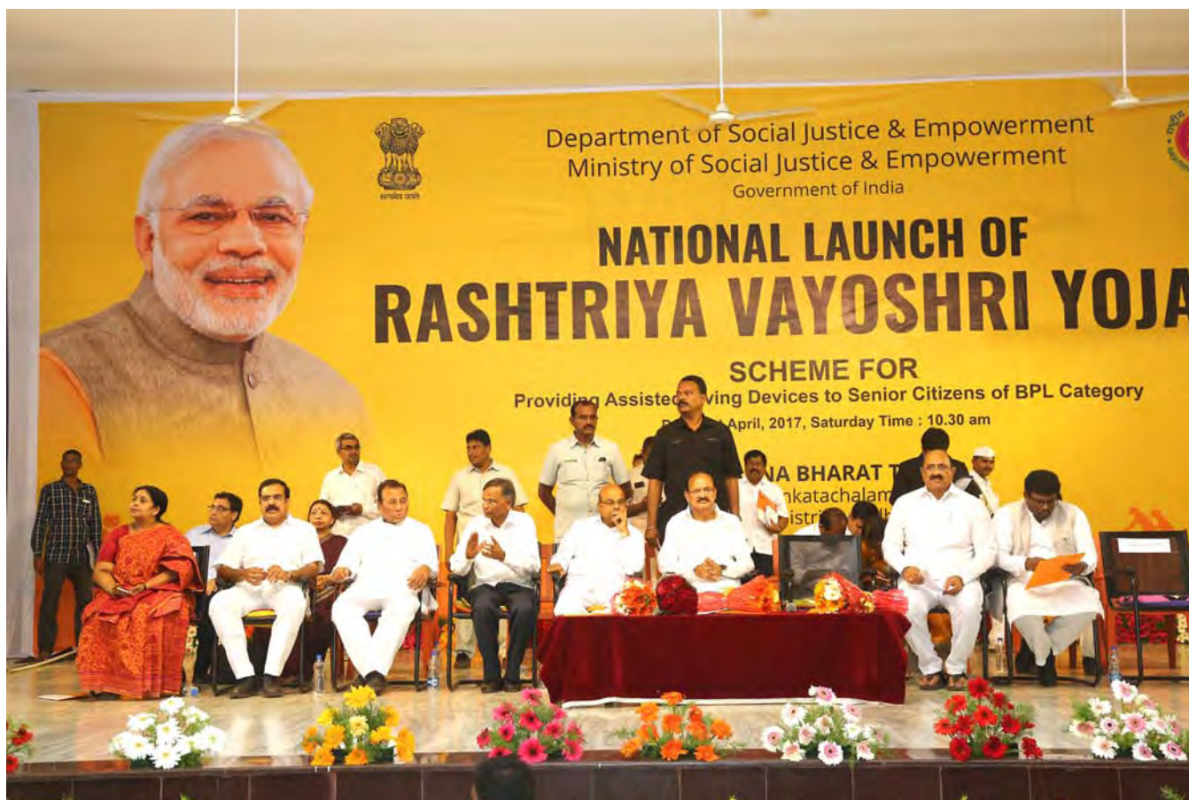
National Launch of Rashtriya Vayoshri Yojana Scheme for providing assistance Living Devices to Senior Citizens of BPL Category on 01.04.2017 at Nellore (A.P.)

and Empowerment. In the meeting progress of various schemes of the Department were reviewed, including pending issues and Utilization Certificates: