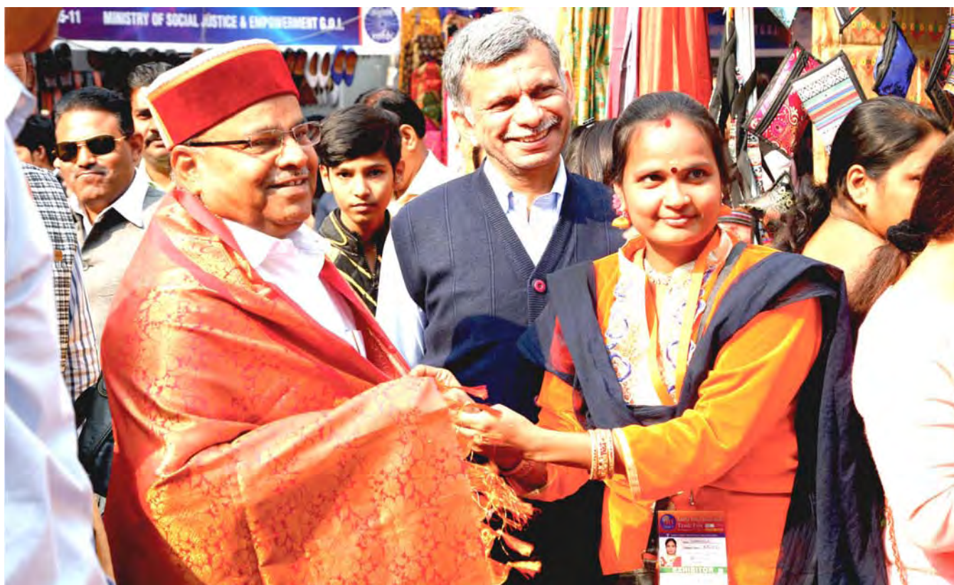
Shri Thaawarchand Gehlot, Hon'ble Union Minister (SJ&E) interacting with beneficiary during IITF at Pragati Maidan, New Delhi.