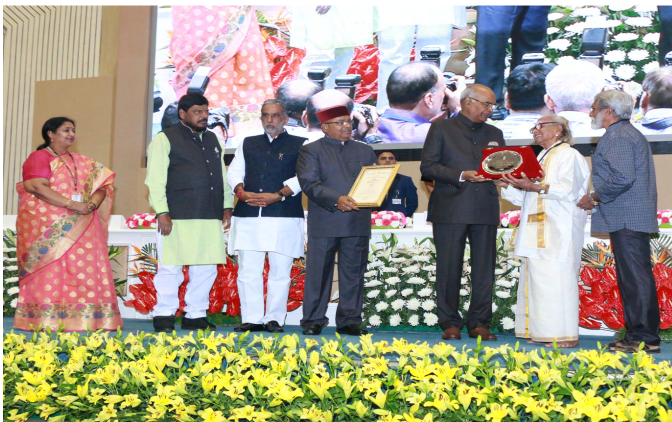
Hon'ble President, Shri Ram Nath Kovind, presenting Vayoshreshtha Samman to Awardees on the occasion of International Day of Older Persons, 2017 at Vigyan Bhawan, New Delhi.

with State Governments, Non-Governmental Organisations and the civil society. The programmes for senior citizens aim at their welfare and maintenance, especially for indigent senior citizens, by supporting old age homes, day care centres, mobile medicare units, etc. For victims of substance abuse, the programme is for drug demand reduction which is achieved through