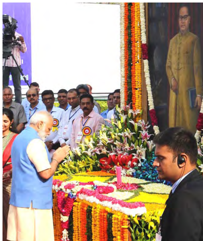
Hon'ble Prime Minister Sh. Narender Modi paying floral tribute to Dr. B.R. Ambedkar

under the Chairmanship of the Hon’ble Prime Minister on Nationwide Celebration of 125 th Birth Anniversary of Dr. B.R. Ambedkar decided in its first meeting held on 23.7.2015 that in order to increase awareness about the Constitution amongst citizens, particularly children, November 26 th may be celebrated as Constitution Day every year, as it was on this day, that the Constitution of India was adopted.