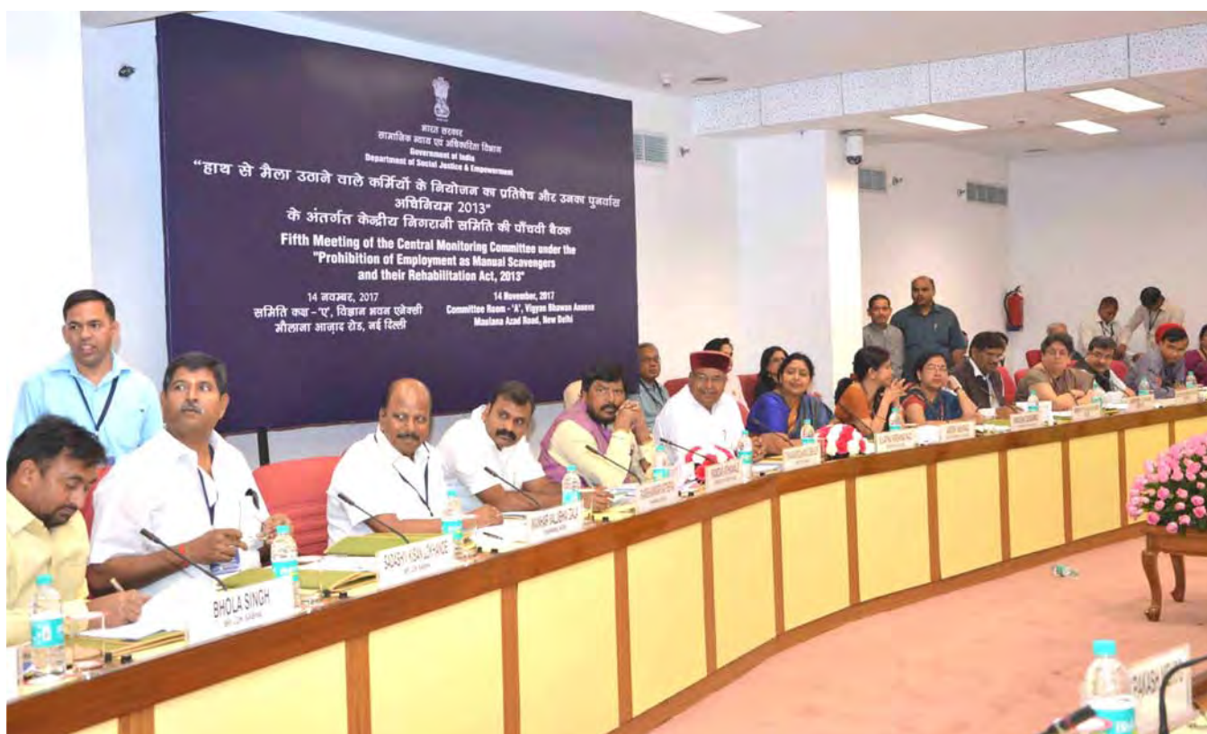
Fifth Meeting of Central Monitoring Committee under the "Prohibition of Employment as Manual Scavenges and their Rehabilitation Act, 2013. 14 November, 2017 at Vigyan Bhawan.