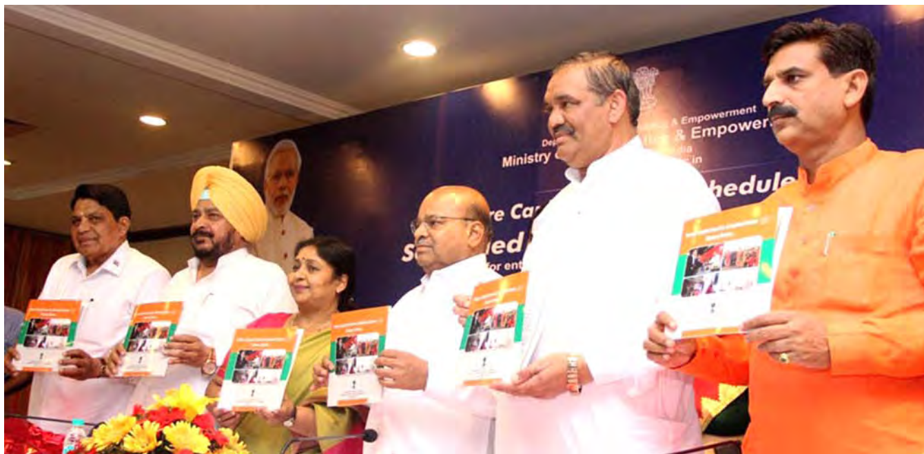
Inauguration of book release during Regional Conference of Ministers of Social Welfare of the State/UTs at Chandigarh.