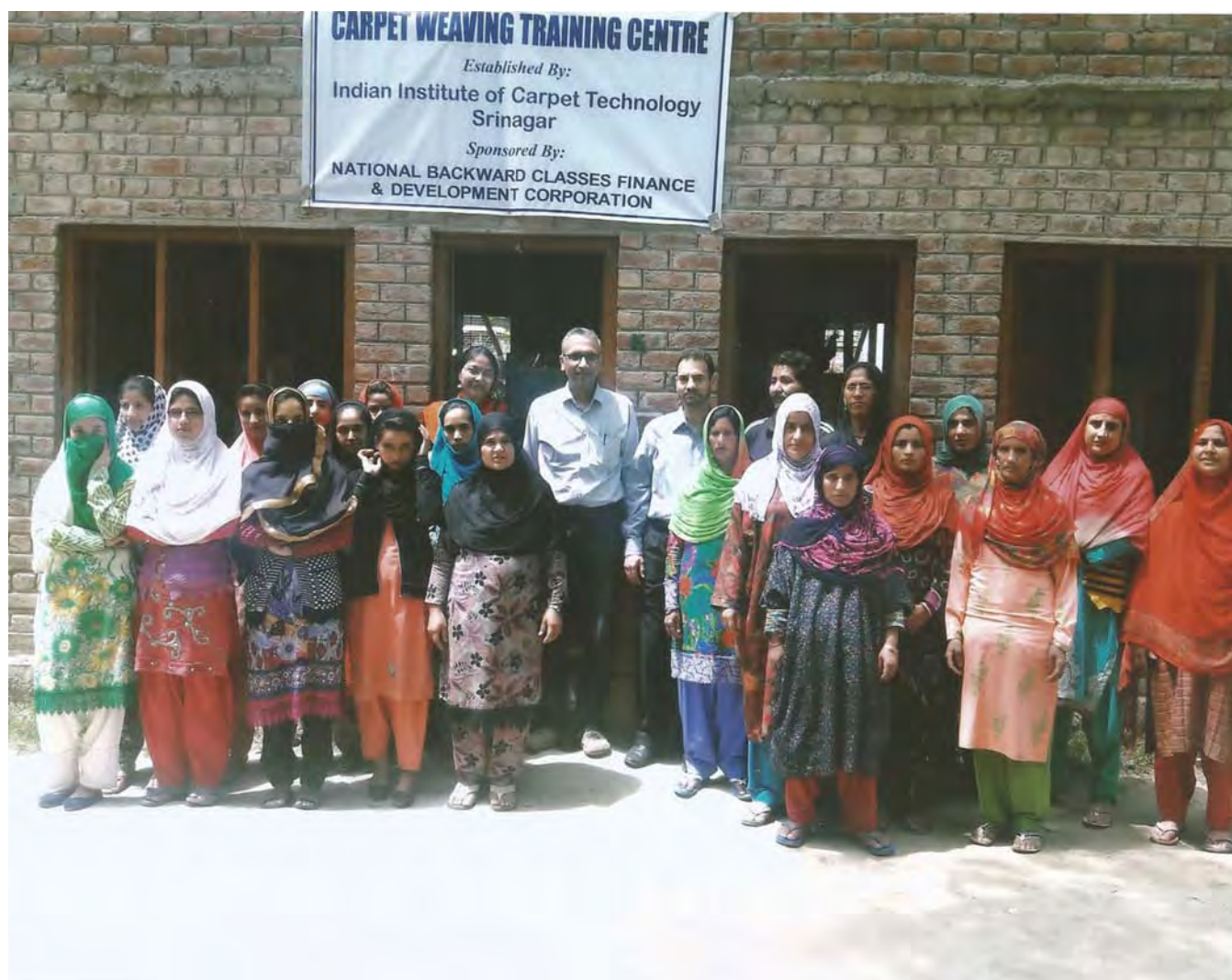
Women Beneficiaries during Carpet Weaving Training Centre

The financial and physical achievements under MSY & MKY schemes during the last 2 years and current year as on 31.12.2017 are as given in Table 9.4: