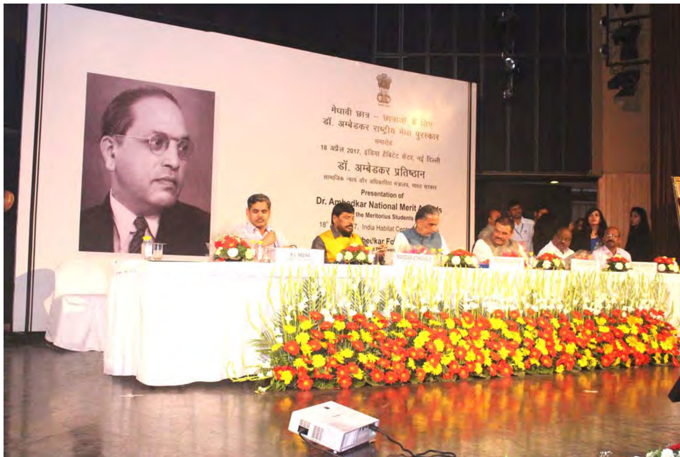
Dr. B.R. Ambedkar National Merit Award to meritorious student of examination 2016 on April 18, 2017