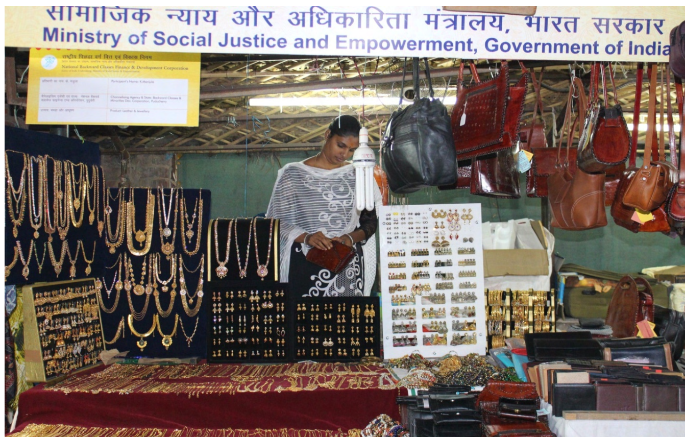
NBCFDC Beneficiary from Puducherry

Backward Classes and to assist these classes by way of loans and advances for economically and financially viable schemes and projects. The Corporation also assists these classes by way of loan for pursuing general/professional/technical education or training at graduate and higher levels and to assist in the upgradation of technical and entrepreneurial skills of Backward Classes for proper and efficient management of production units. Schemes are implemented through State Channelising Agencies (SCAs) nominated by respective State Government/UT and PSBs/RRBs. It also conducts Skill Development Training Programme (SDTP) through Government Training Institutes and Sector Skill Councils.