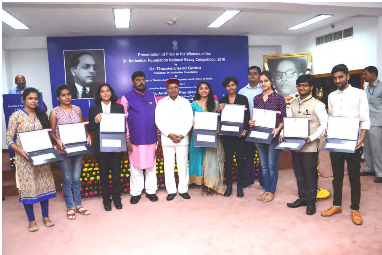
The Union Minister of SJ&E, Dr. Thaawarchand Gehlot with the winners of Essay Competition organised by Dr. Ambedkar Foundation, New Delhi on 11.10.2017. The Minister of State for Social Justice & Empowerment, Shri Ramdas Athawale was also present.

40% Copper and 05% each Nickel and Zinc. The coin of Rs. 10/- has a diameter of 27 mm, its weight 7.71 grams and made up of an alloy of Outer Ring (Aluminum Bronze) 92% Copper, Aluminum 06%, Nickel 02% and Centre piece (Cupro Nickel) Copper 75% and Nickel 25%. The Price of each set of Commemorative Coins is Rs. 3,480/- and out of 1000 sets, 805 sets has already been sold out.