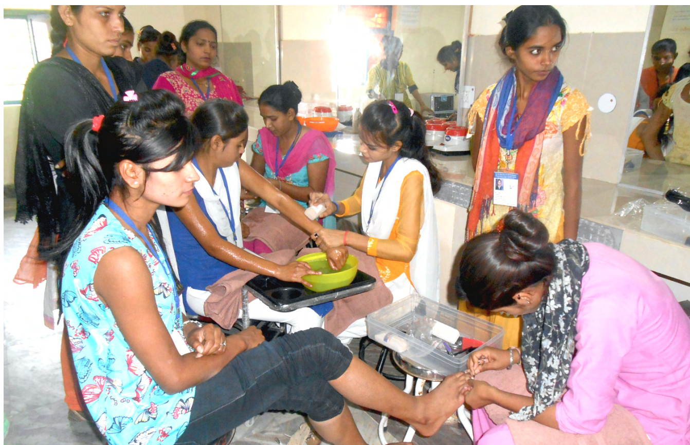
Trainees undergoing Skill training at K.N. Modi Centre, Modinagar, Meerut under the Beauty & Wellness Skill Sector Council.