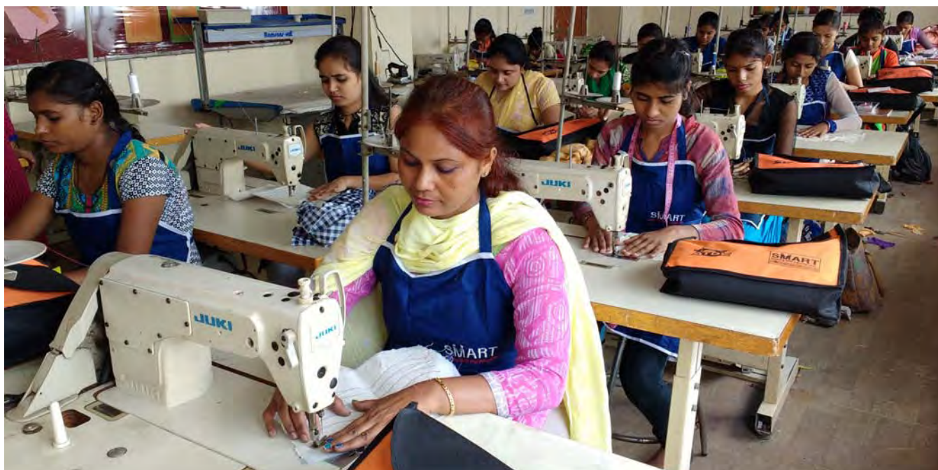
Trainees undergoing Sewing Machine Operator course conducted by Apparel Training & Design Centre (ATDC) at Delhi.

development programme for Scheduled Castes, Safai Karamcharies and Backward Classes is being implemented by the three Finance and Development Corporations under the Department of Social Justice & Empowerment viz. (i) National Scheduled Castes Finance and Development Corporation (ii) National Safai Karamcharis Finance and Development Corporation, and (iii) National Backward Classes Finance and Development Corporation.