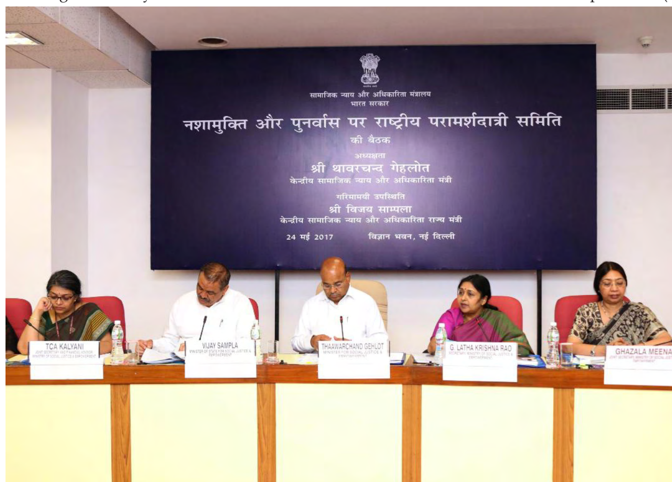
Shri Thaawarchand Gehlot, Hon'ble Minister for Social Justice and Empowerment chairing the meeting of National Consultative Committee on De-addiction and Rehabilitation held on 24th May, 2017.

‘Scheme of Assistance for the Prevention of Alcoholism & Substance (Drugs) Abuse and for Social Defence Services’ is the flagship scheme of the Ministry in the field of drug demand reduction. The Scheme has two parts viz. (i)