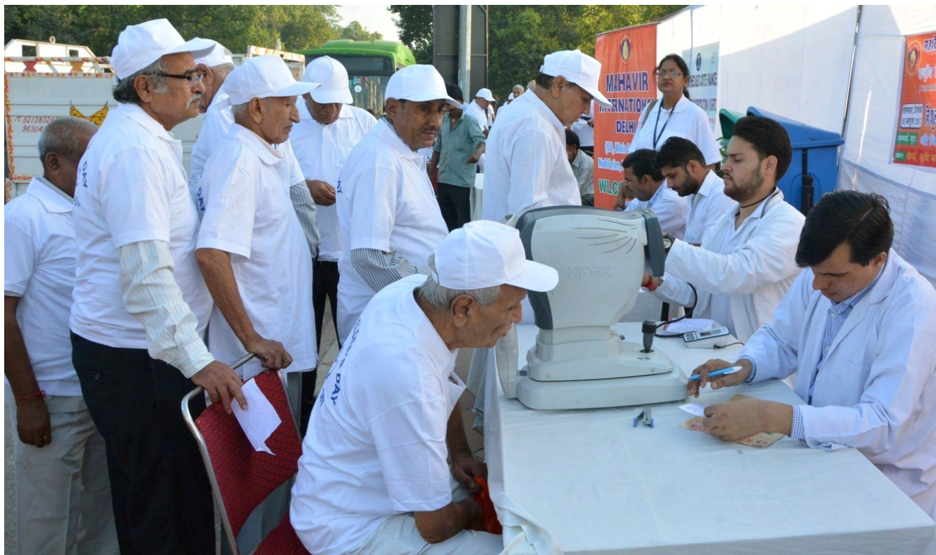
Health Camps for senior citizens with specialists/doctors from Ram Manohar Lohia Hospital, New Delhi on 2nd October, 2017

declared as inoperative account. The Fund will be administered by an Inter-Ministerial Committee with the Ministry of Social Justice and Empowerment as the Nodal Ministry for administration of the Fund. Secretary, Ministry of Social Justice and Empowerment shall be the