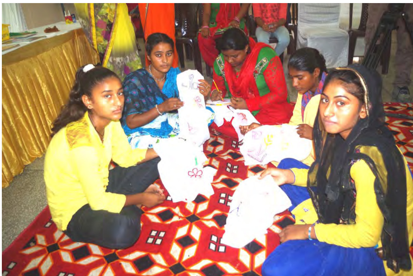
Women Beneficiaries of the Corporation under SDTP

NSFDC had introduced the Scheme titled 'Mahila Samriddhi Yojana (MSY)' - an exclusive Micro-Credit Scheme for women beneficiaries during 2003-04 to provide loans upto Rs.25,000/- per unit at an interest rate of 4% per annum (rebate of 1%) as compared to the Micro-Credit Finance Scheme. During the year 2006-07, the unit cost limit under MSY was raised to Rs.30,000/-, which was further raised to Rs.50,000 in 2012-13 to enable the women beneficiaries to take up income generating activities with higher investment. On repayment of loan under MSY, the beneficiaries can once again avail any loan under NSFDC Schemes.