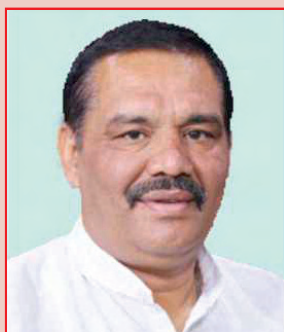
Sh. Vijay Sampla Minister of State for Social Justice & Empowerment