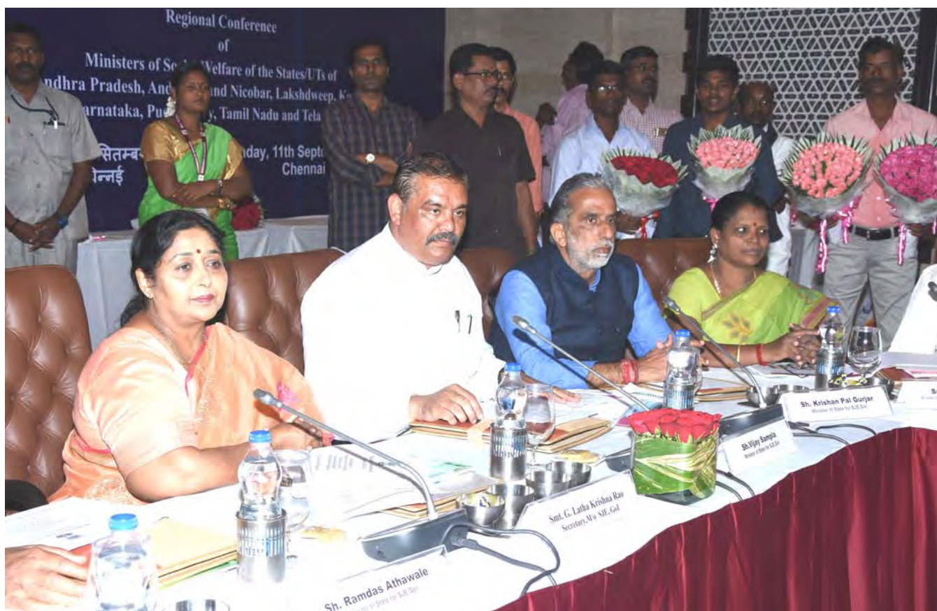
Regional Conference of Ministers of Social Welfare of the State/UTs at Chennai