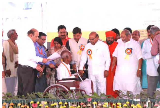
Assisted Living Devices distributed to Senior Citizens during Camp on "Rashtriya Vayashree Yojana of Ministry of Social Justice & Empowerment at Ujjain, M.P.

Delhi, under the guidance of Shri Thaawar Chand Gehlot, Hon'ble Minister, Social Justice and Empowerment.