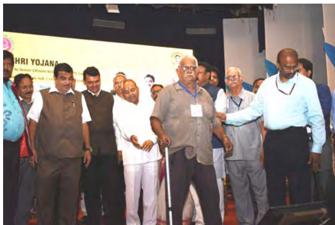
Assisted Living Devices distributed to Senior Citizens during camp on "Rashtriya Voyashree Yojana of Ministry of Social Justice and Empowerment on 04.05.2017 at Nagpur.

funded from Senior Citizens Welfare Fund. An amount of Rs. 16.00 cr. was released to ALIMCO during the year 2016-17 for implementation of the scheme of RVY.