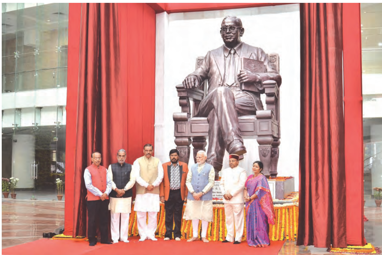
Hon'ble Prime Minister at inauguration function of Dr. B.R. Ambedkar International Centre, New Delhi on December 7, 2017

Victims of Substance Abuse: Authentic data not available. Around 1% of the population is believed to be victims of substance abuse.