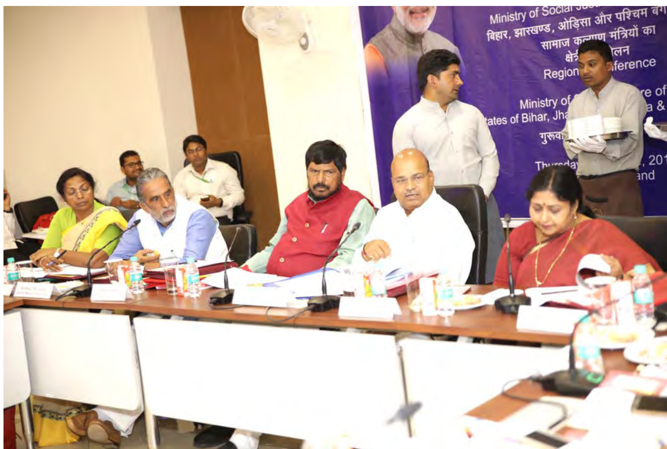
Regional Conference at Ranchi