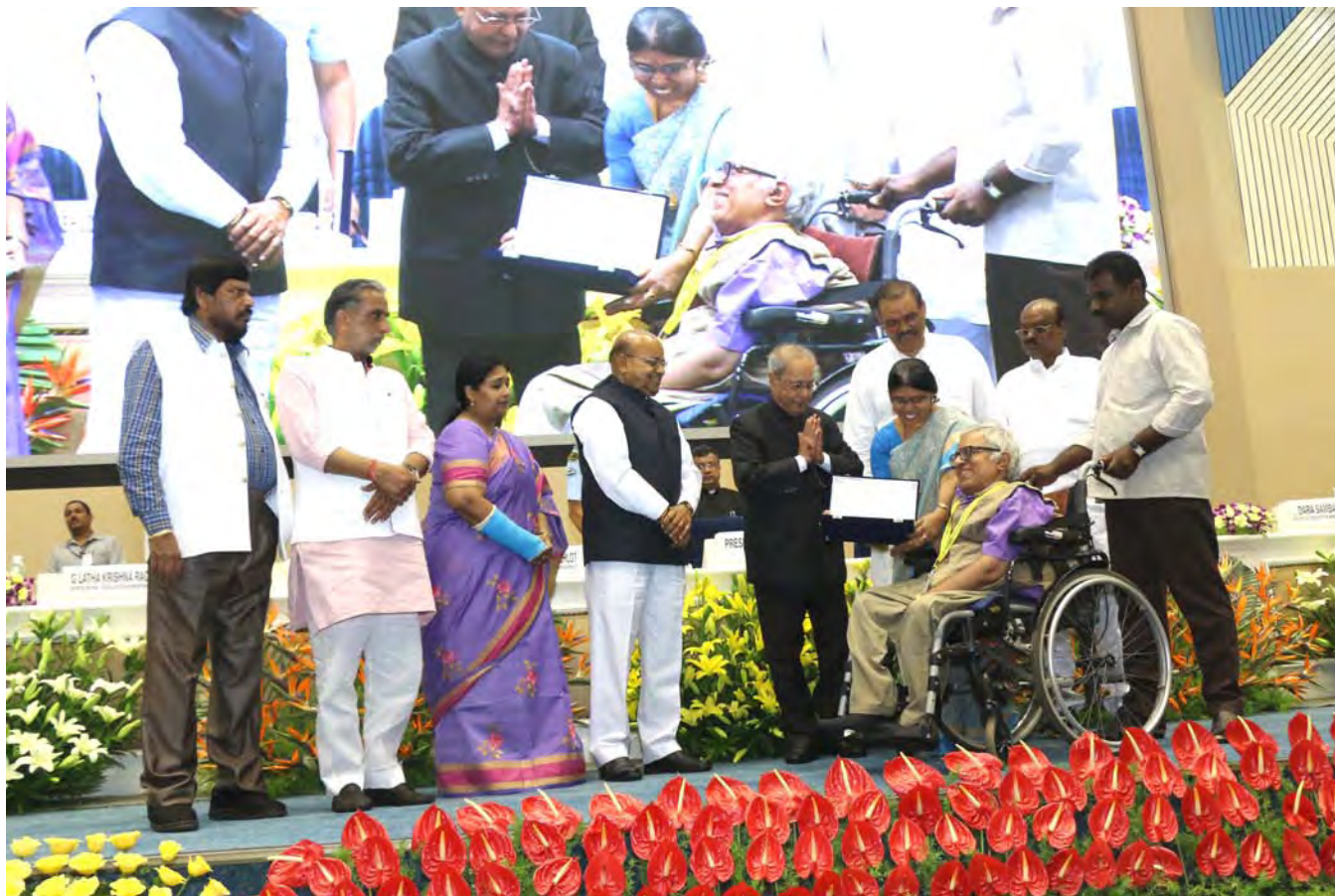
Dr. Ambedkar National Award for Social Understanding and Upliftment of Weaker Sections.

observance of International Day against Drug Abuse and Illicit Trafficking which was attended by about 700 participants including officers from Central Armed Police Forces, students from schools/colleges etc.