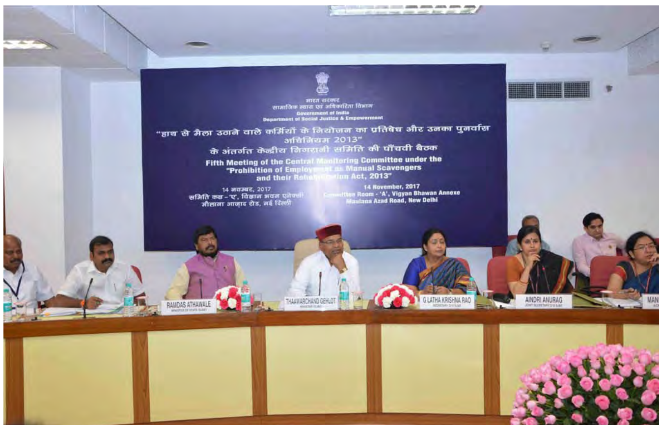
Fifth Central Monitoring Committee Meeting on SRMS

II. In order to liberate the manual scavengers from their traditional occupation and to provide rehabilitation to them a National Scheme for Liberation and Rehabilitation