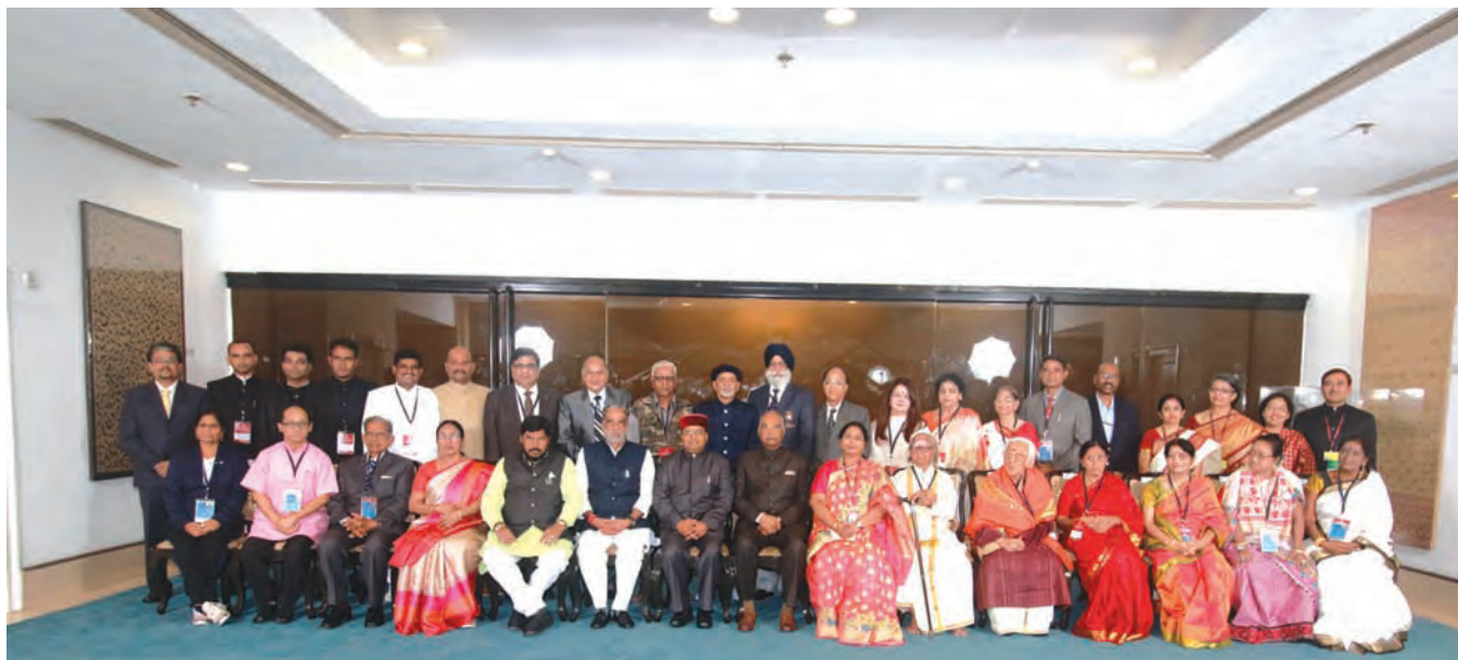
"Awardees of Vayoshree Samman and Officers of D/o Social Justice & Empowerment with Hon'ble President of India