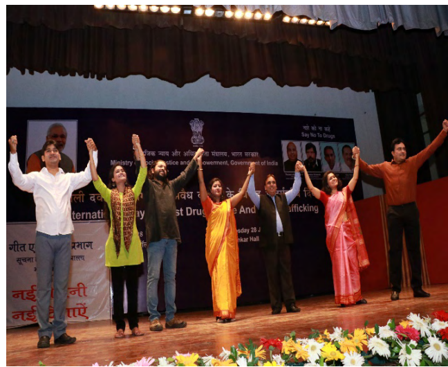
Artists performing pantomime show (left) and skit (right) on the occasion of International Day against Drug Abuse and Illicit Trafficking to sensitize people on the ill-effects of drug abuse.

Empowerment has published a Notification in the Gazette of India on 31.12.2012 about the “Scheme of National Awards for outstanding services in the field of Prevention of Alcoholism and Substance (Drug) Abuse”. Further, this Scheme has been revised and published the Notification in the Gazette of India on 30.12.2015. The Scheme is applicable to institutions and individuals working in the field of Prevention of Alcoholism and Substance (Drug) Abuse. The awards are conferred on the awardees in a function to be held in New Delhi on the 26 th June of every alternate year, on the occasion of “International Day against Drug Abuse and Illicit Trafficking”. So far three National Awards functions have been held on 26 th June, 2013, 26 th June, 2014 & 26 th June, 2016.