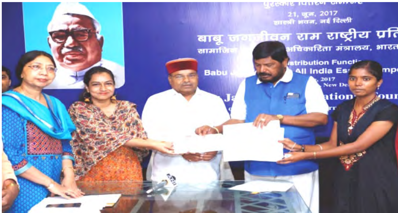
Hon'ble Minister for Social Justice and Empowerment; Shri Thaawarchand Gehlot distributing prize to winners of Babu Jagjivan Ram All India Essay Competition on 21.06.2017.