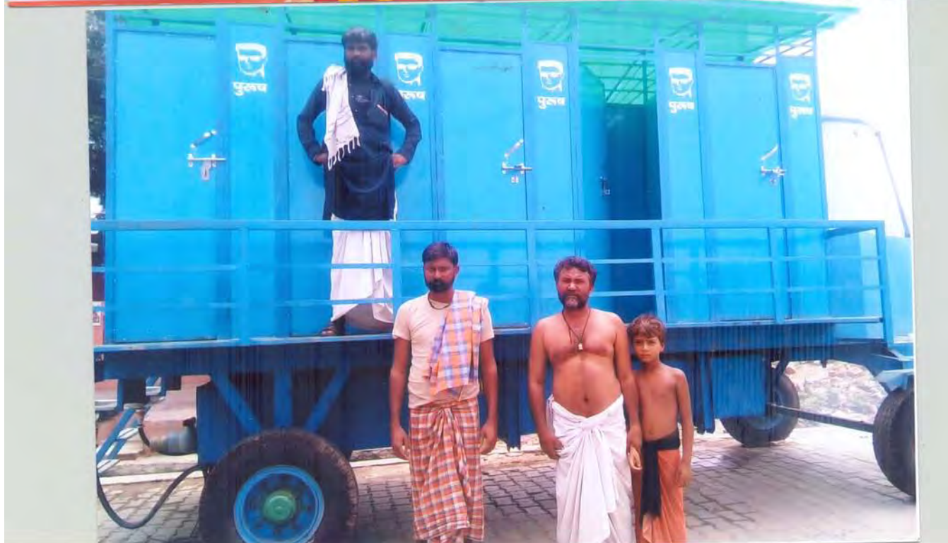
Hon'ble Minister dedicating Mobile Toilets to DNT Community of Gohana, Haryana, 30 June, 2017