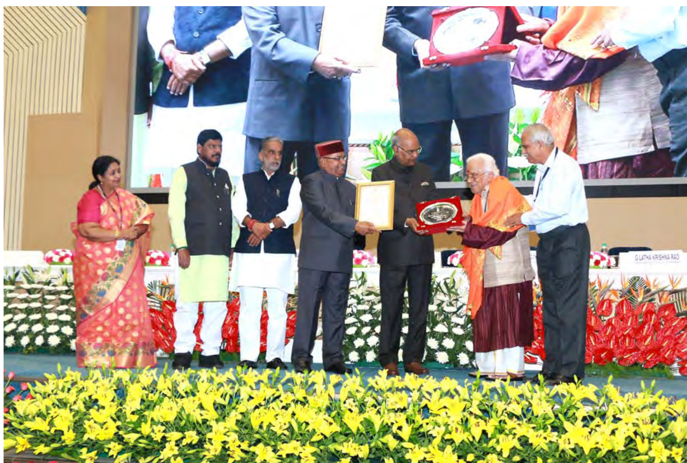
Hon'ble President, Shri Ram Nath Kovind, presenting Vayoshreshtha Samman to Awardees on the occasion of International Day of Older Persons, 2017 at Vigyan Bhawan, New Delhi.