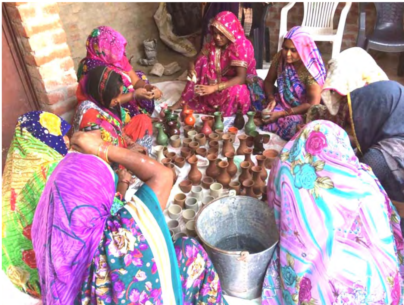
Women beneficiaries of the Corporation