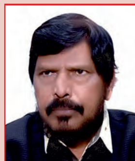
Sh. Ramdas Athawale Minister of State for Social Justice & Empowerment

The Organizational setup of the Department of SJ&E is at Annexure-1.2 .