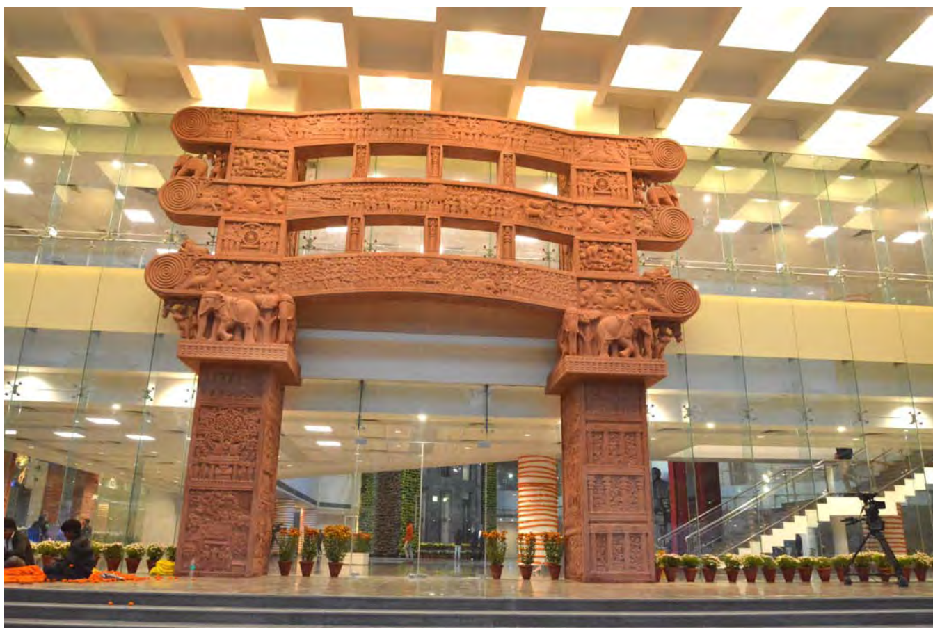
Dr. Ambedkar International Centre, New Delhi

procedure for survey of manual scavengers and finalization of list of identified manual scavengers.