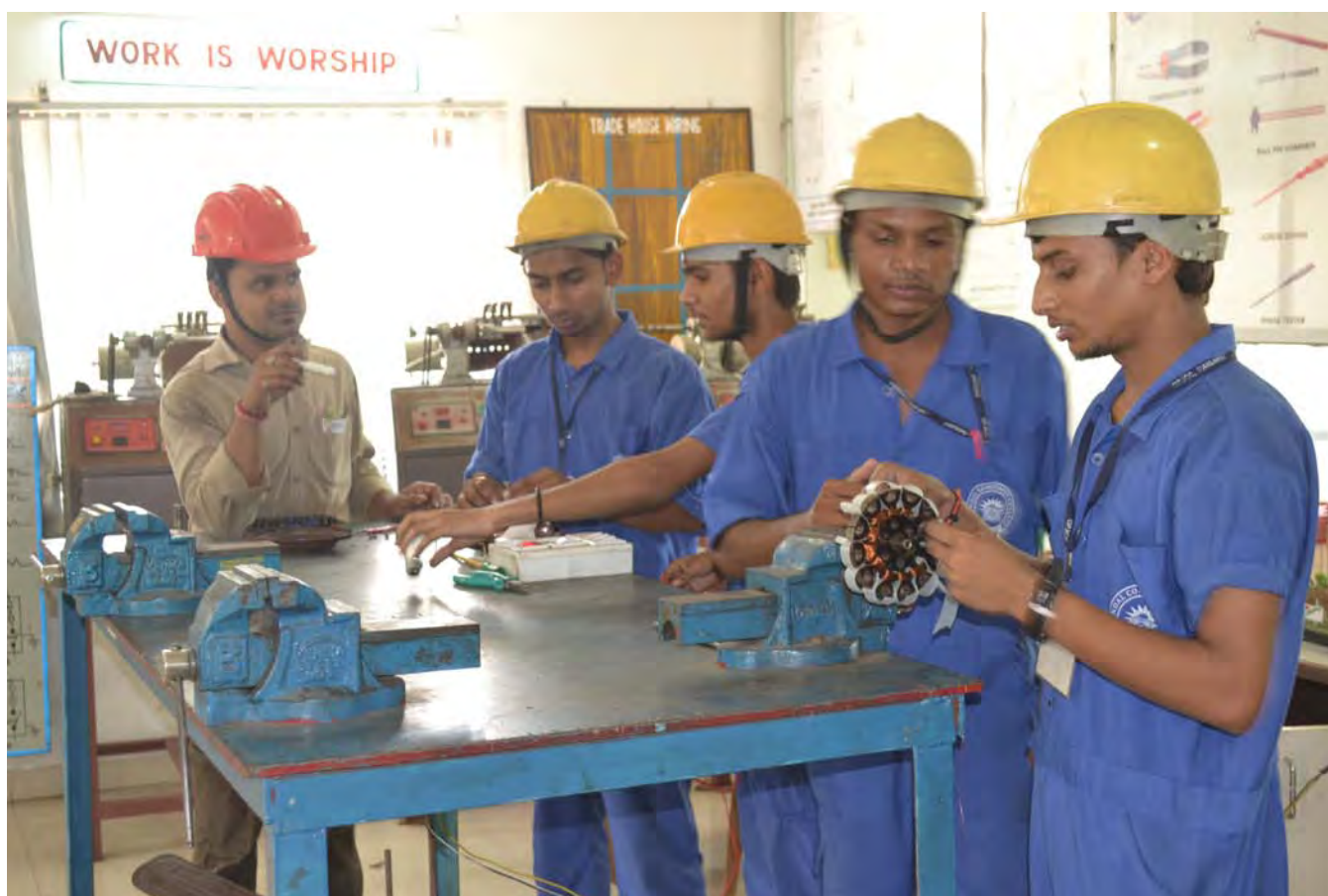
OBC Beneficiaries getting training under Skill Development Training Programme of NBCFDC

National Backward Classes Finance and Development Corporation (NBCFDC), a Government of India Undertaking under the aegis of Ministry of Social Justice & Empowerment was incorporated on January 1992 and has an authorized share capital of Rs.1500 crore. The main objective of the Corporation is to promote economic and developmental activities for the benefit of