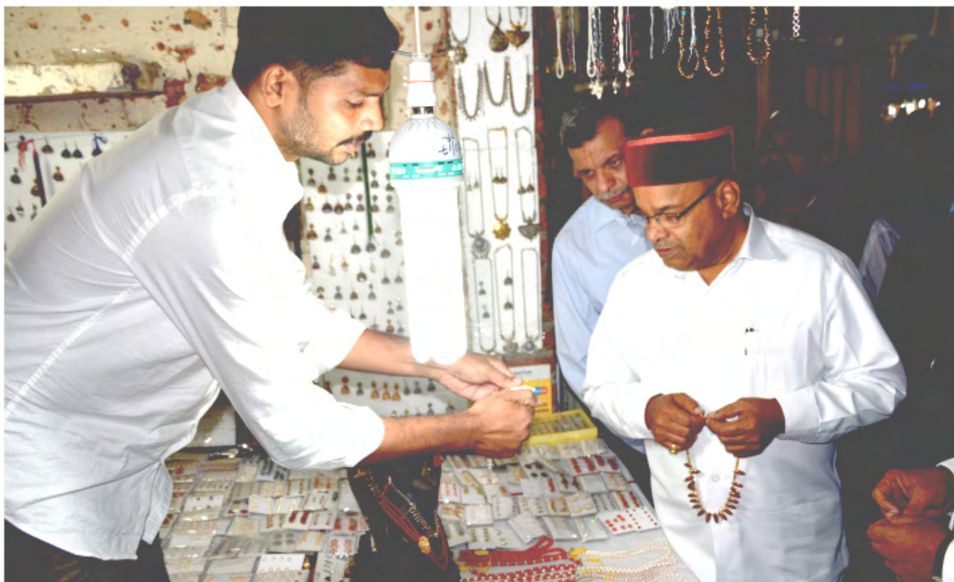
Hon'ble Minister interacting with the beneficiaries of Credit Scheme of NBCFDC