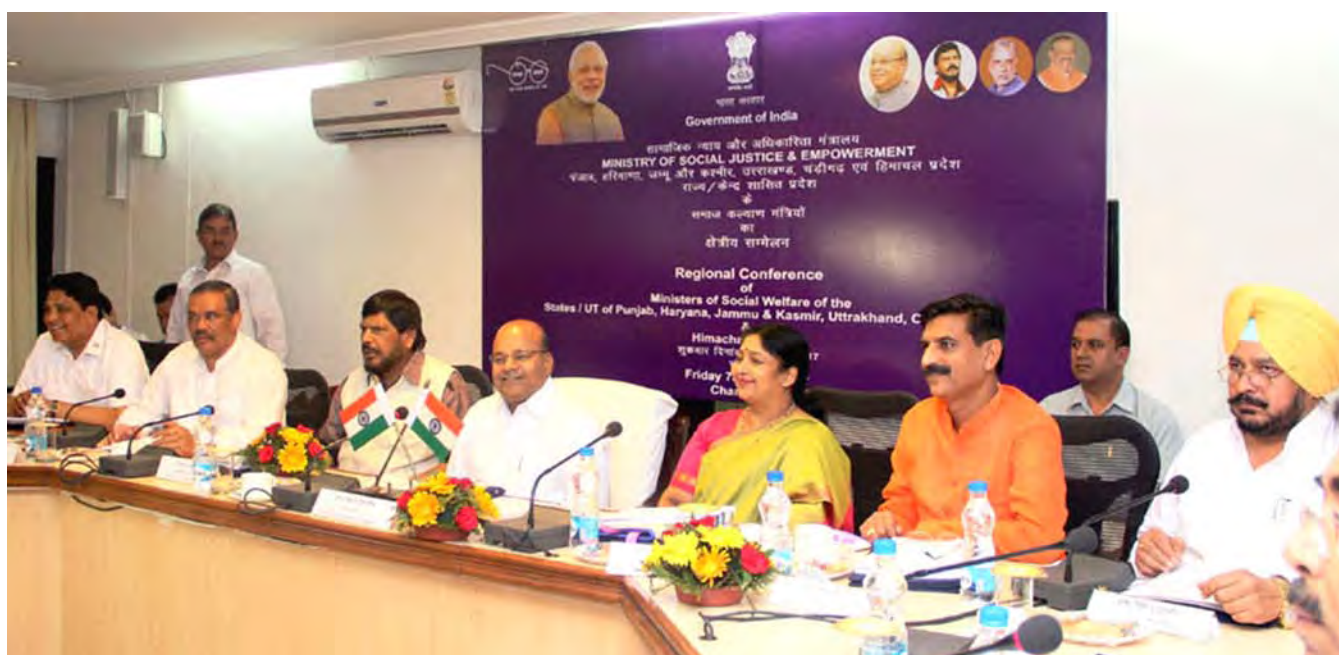
Regional Conference of Ministers of Social Welfare of the State/UT at Chandigarh.