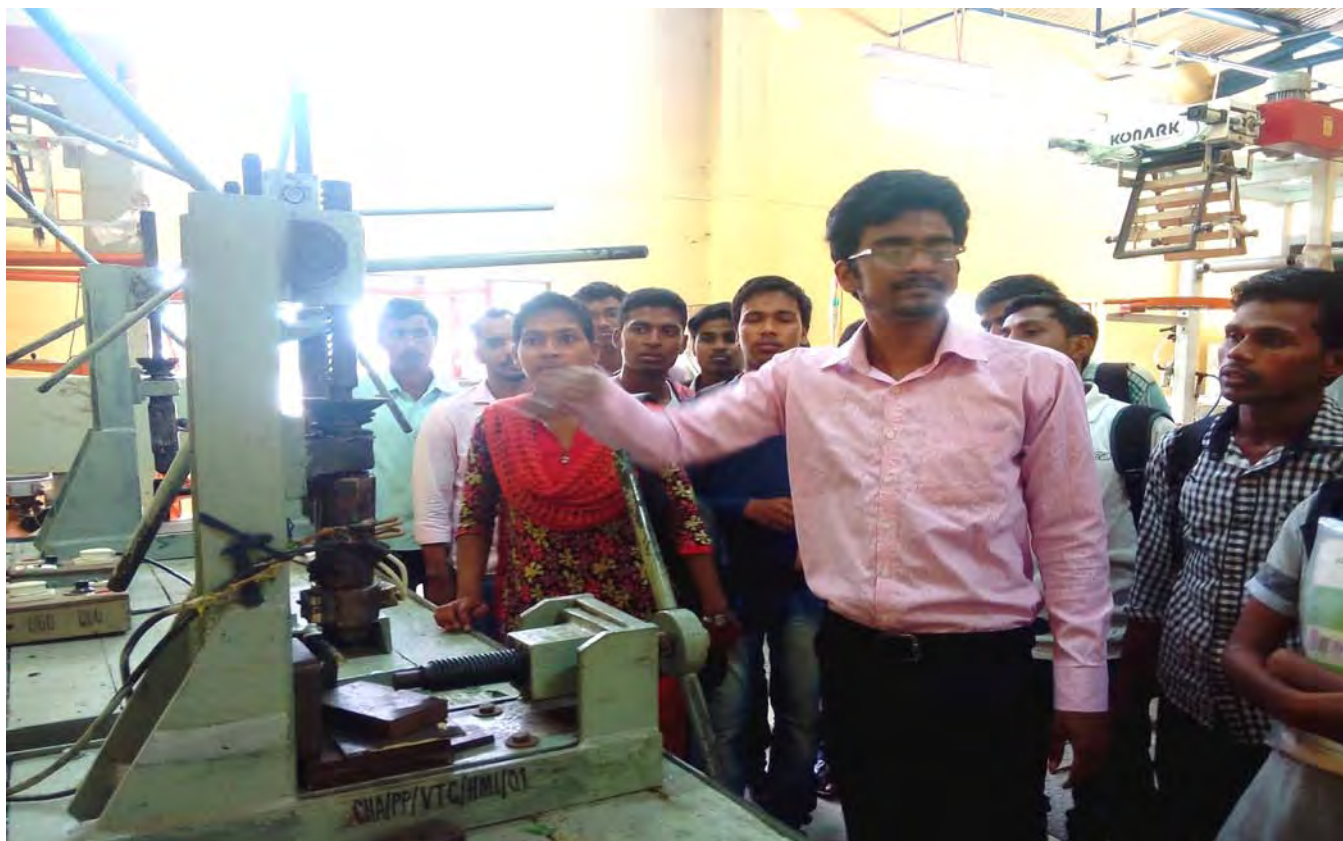
Skill Development Training program on Machine Operator conducted through CIPET, Vijayawada under the CSR activities