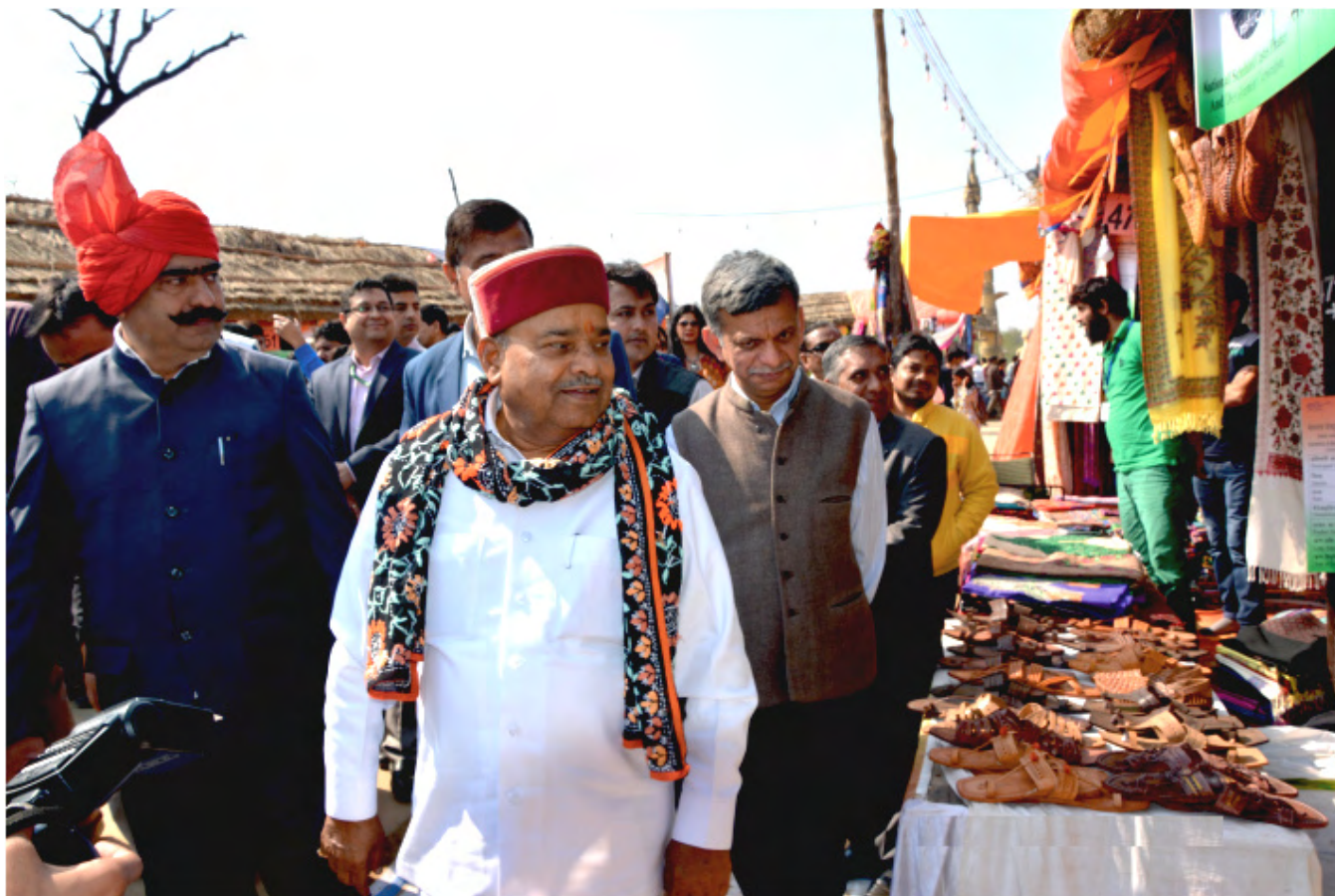
Shri Thaawarchand Gehlot, Hon'ble Union Minister (SJ&E) visiting stalls of beneficiaries during Surajkund Mela held at Faridabad, Haryana.