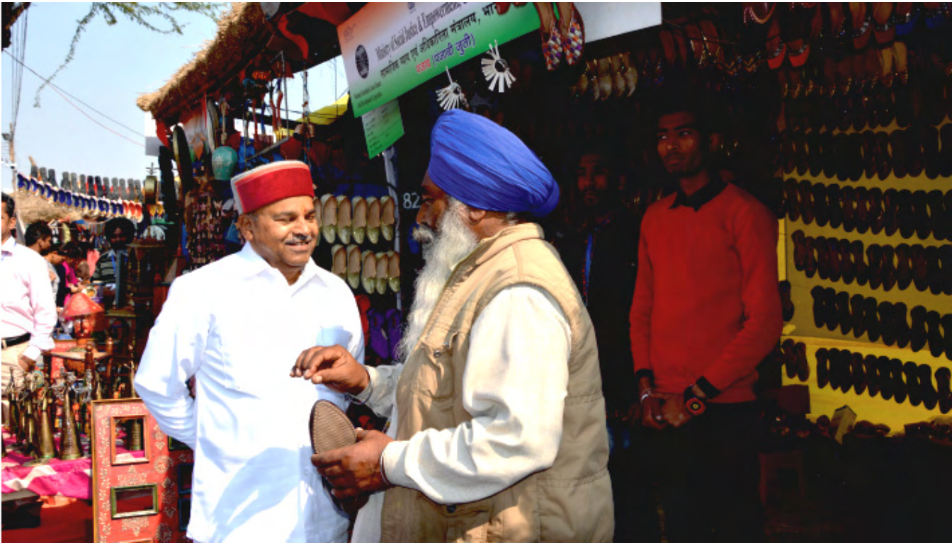
Shri Thaawarchand Gehlot, Hon'ble Union Minister (SJ&E) interacting with beneficiary during Surajkund Mela at Faridabad, Haryana.

The Corporation is also targeting to upskill the traditional artisans who form a major chunk of the target group through its Recognition of Prior Learning (RPL) skill upgradation training initiatives, which should help empower these self-employed persons both socially & economically. NBCFDC signed MoAs with seven SSCs/Training Institutes during 2017-18.