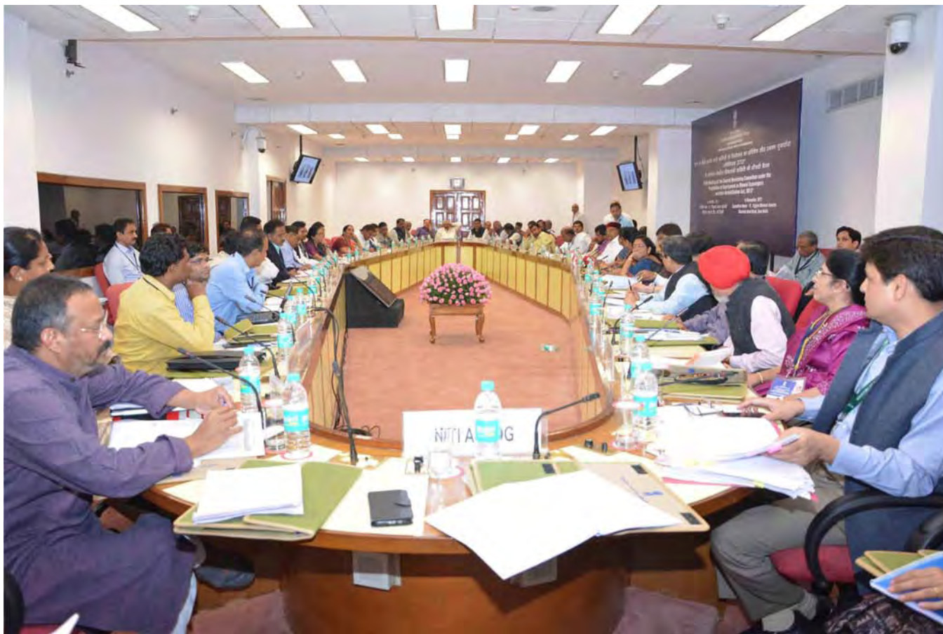
Central Monitoring Committee of MOSJE, in New Delhi on November 14, 2017

Justice and Empowerment in March, 2006. Apart from official members, the Committee has three non-official representatives from amongst Scheduled Castes and Scheduled Tribes, as Members. The Committee has so far held twenty three meetings wherein implementation status of PCR Act and PoA Act in 24 States and 4 Union Territories were reviewed. The last meeting of the Committee was held on 19-12-2016.