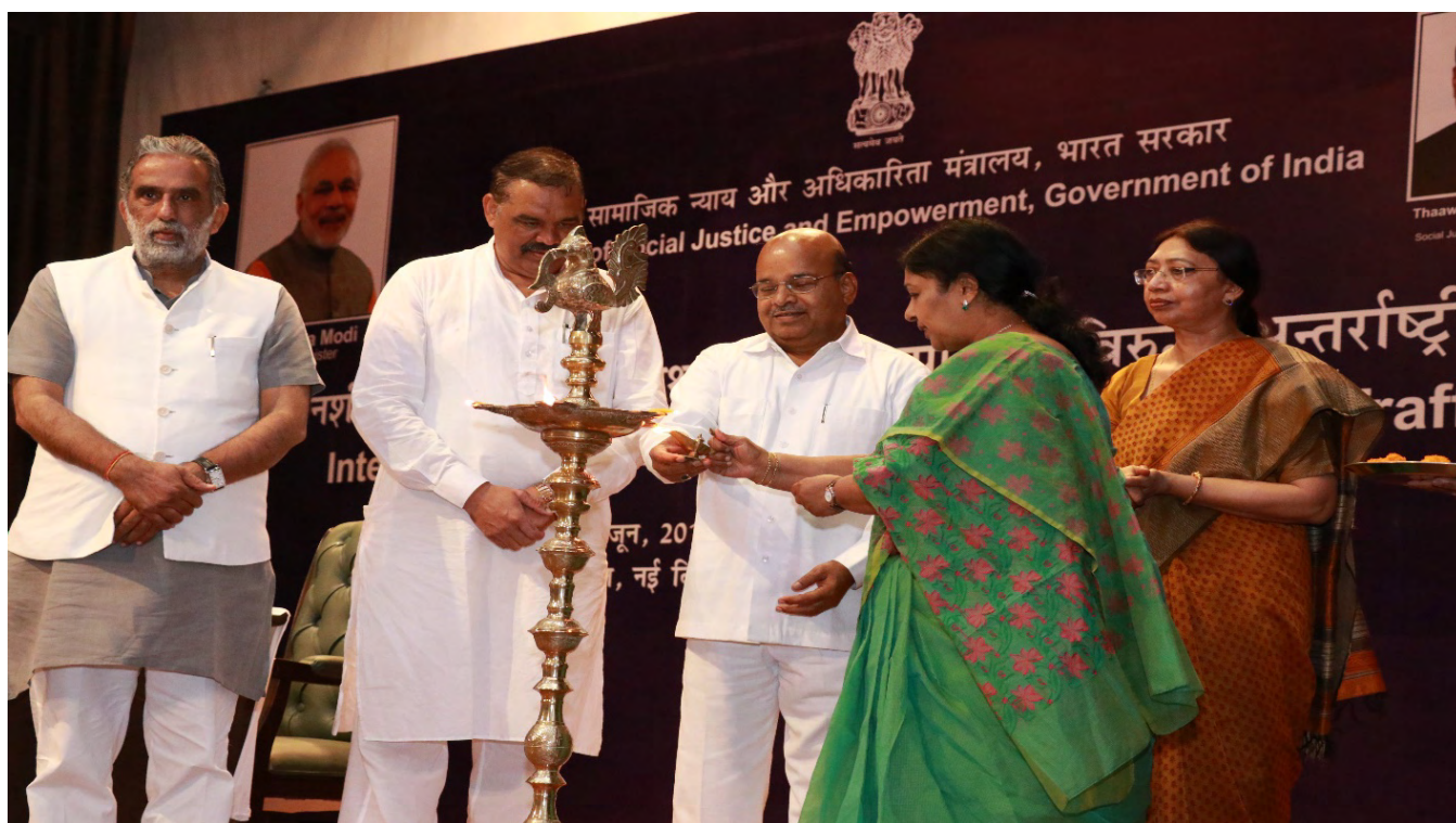
Shri Thaawarchand Gehlot, Hon'ble Minister for Social Justice and Empowerment, Shri Vijay Sampla, Hon'ble Minister of State for Social Justice and Empowerment, Shri Krishan Pal Gurjar, Hon'ble Minister of State for Social Justice and Empowerment and Secretary, Department of Social Justice and Empowerment lighting the lamp on the occasion of International Day Against Drug Abuse and Illicit Trafficking.

Substance abuse being a psycho-socio-medical problem, community based intervention through Non-Government Organisations (NGOs), Panchayat/Municipal bodies, Educational Institutions etc. has been considered as the best approach for treatment and rehabilitation of the addicts. In order to recognise the efforts and encourage excellence in the field of prevention of substance (drug) abuse and rehabilitation of its victims, the Department of Social Justice and