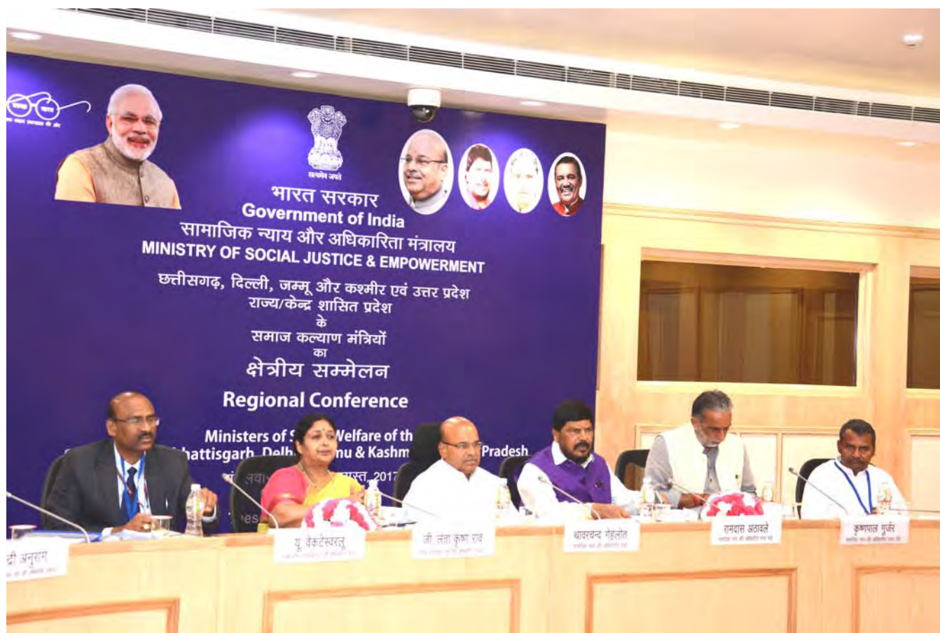
Ministers of MSJE alongwith Secretary and Joint Secretary in Regional Conference, New Delhi

Ministry of Social Justice & Empowerment. The exhibition was organized by the Ministry of Textiles, Government of India from June 30, 2017 to July 2, 2017. 11 (Eleven) Stalls were allotted to this Department's Corporations viz. National Backward Classes Finance Development Corporation, National Scheduled Castes Finance Development Corporation and National Safai Karmacharis Finance Development Corporation.