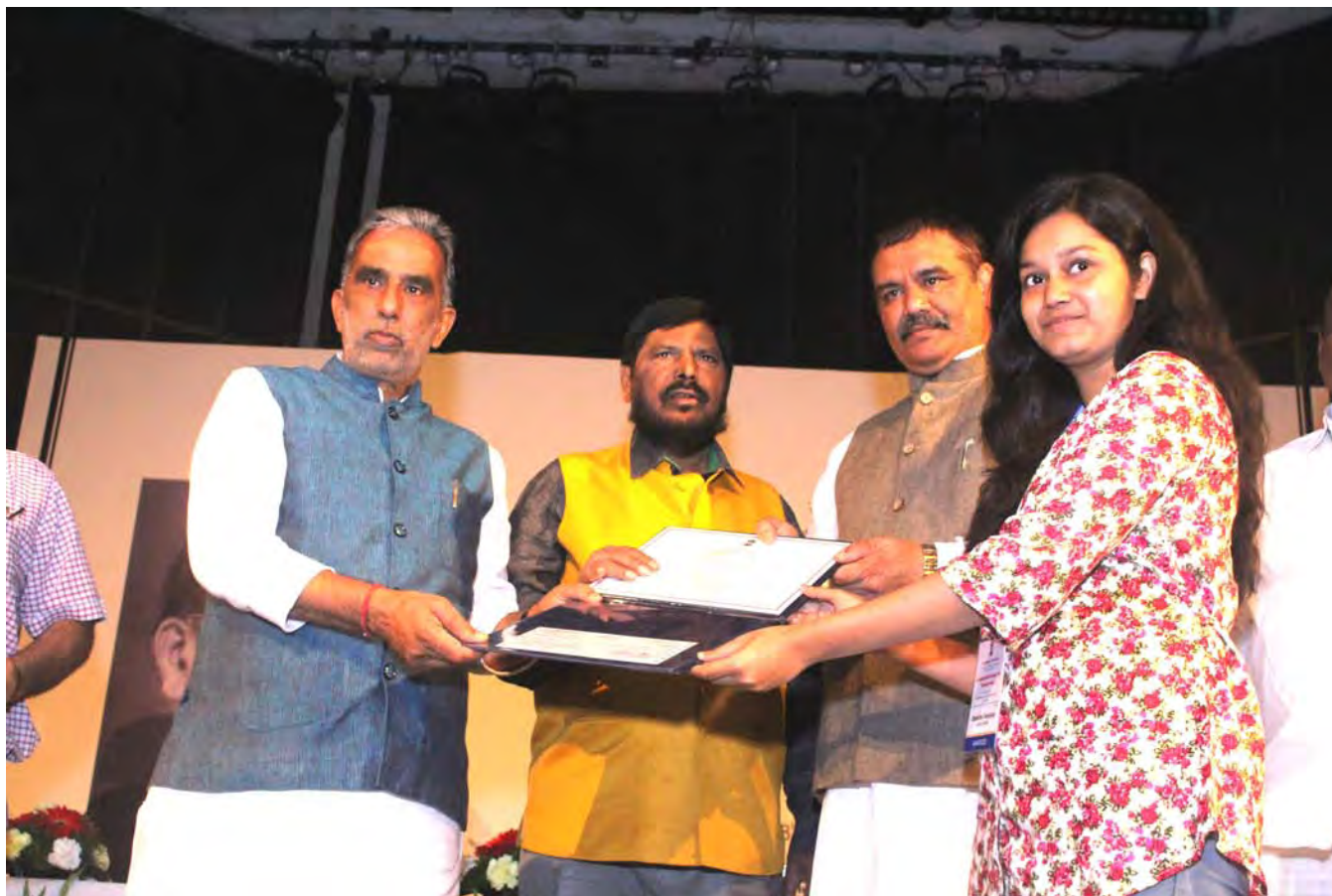
Merit Award 2017

Accordingly, the Government of India notified on 19.11.2015 that 26 th November shall be observed every year as Constitution Day. The first Constitution Day was celebrated on 26.11.2015.