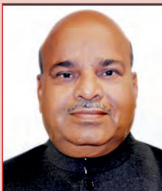
Sh. Thaawarchand Gehlot Cabinet Minister of Social Justice & Empowerment

The Ministry of SJ&E is under the charge of the following Ministers: