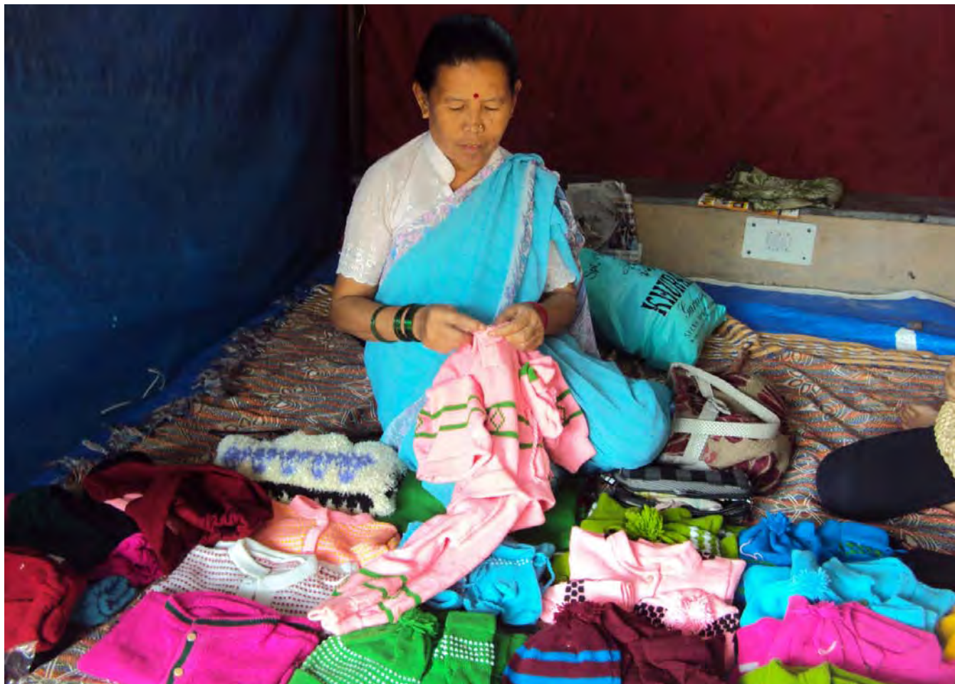
Beneficiary of Skill Development Programme