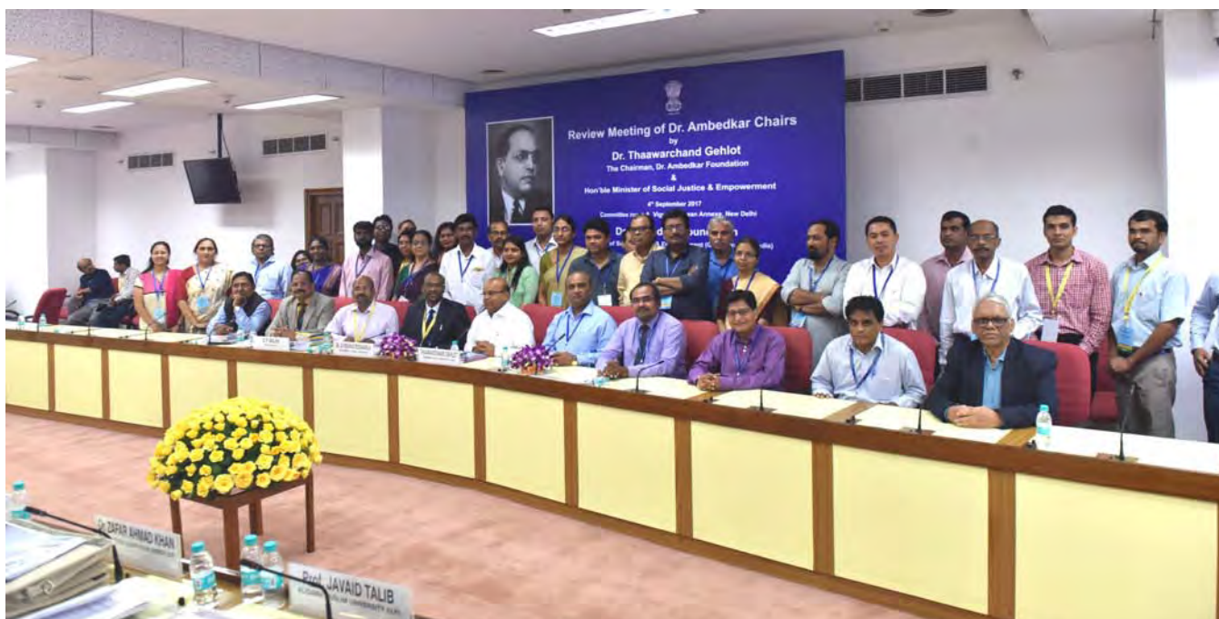
The Union Minister of SJ&E Dr. Thaawarchand Gehlot, Chairman Dr. Ambedkar Foundation in the Meeting of Dr. Ambedkar Chair organised by DAF, New Delhi on 04.09.2017