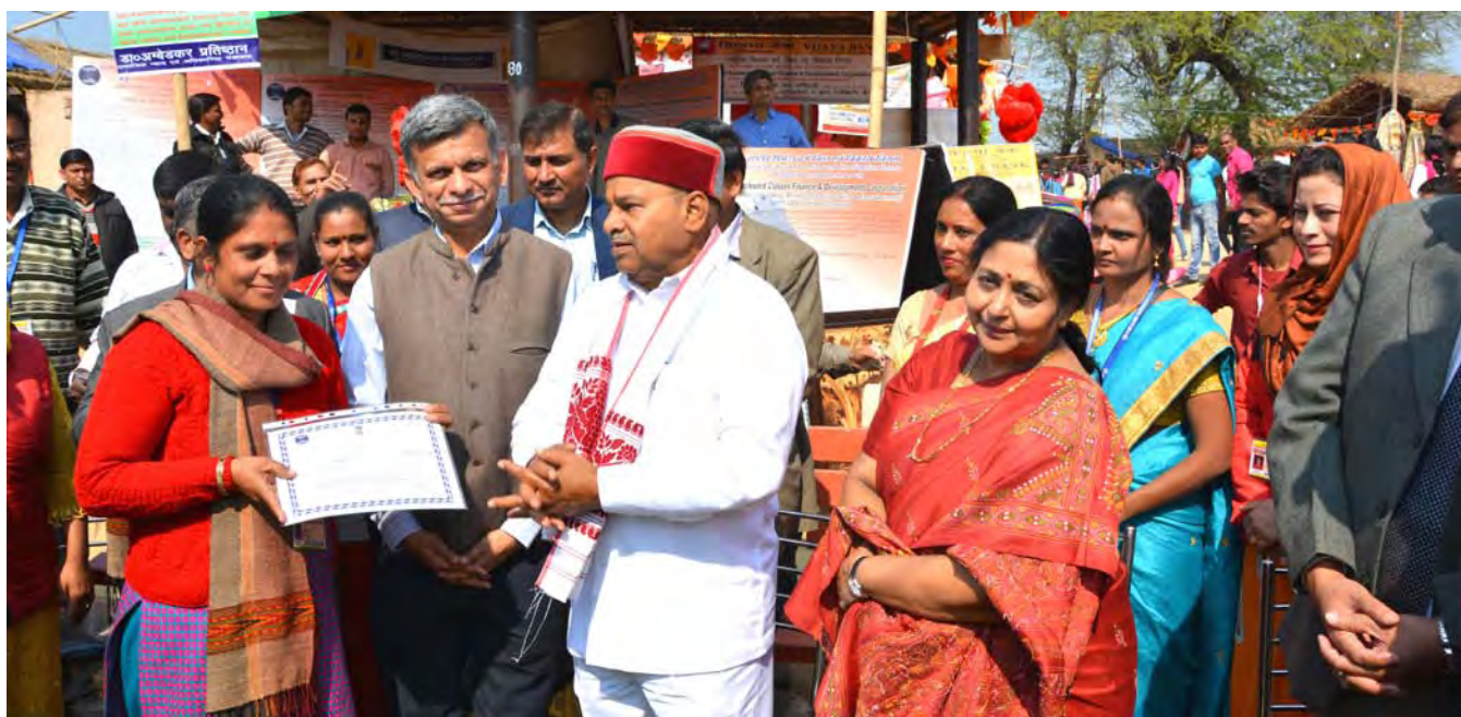
Surajkund Mela 2017

2.4.9 Surajkund Mela- 2017 : The Surajkund Mela was organised from February 1-15, 2017. NSFDC set up 33 stalls from the states like Delhi, Gujarat, Haryana, Himachal Pradesh, karnataka, Madhya Pradesh, Maharashtra, Puducherry, Punjab, Rajasthan, Tripura, Uttar Pradesh, Uttrakhand, West Bengal covering 34 beneficiaries. NSFDC drew sales worth 35.49 lakh Crafts including wooden toys, soft toys, footwear, cloths, and artificial jewellery were put for exhibition and sale. 33 Stalls of NBCFDC were showcased in the mela covering 34 beneficiaries. NBCFDC drew sales worth 46.12 lakhs. 33 stalls of NSKFDC were showcased in mela coving 40 beneficiaries worth Rs. 34.57 lakhs.