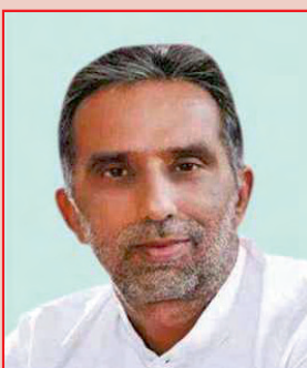
Sh. Krishan Pal Gurjar Minister of State for Social Justice & Empowerment