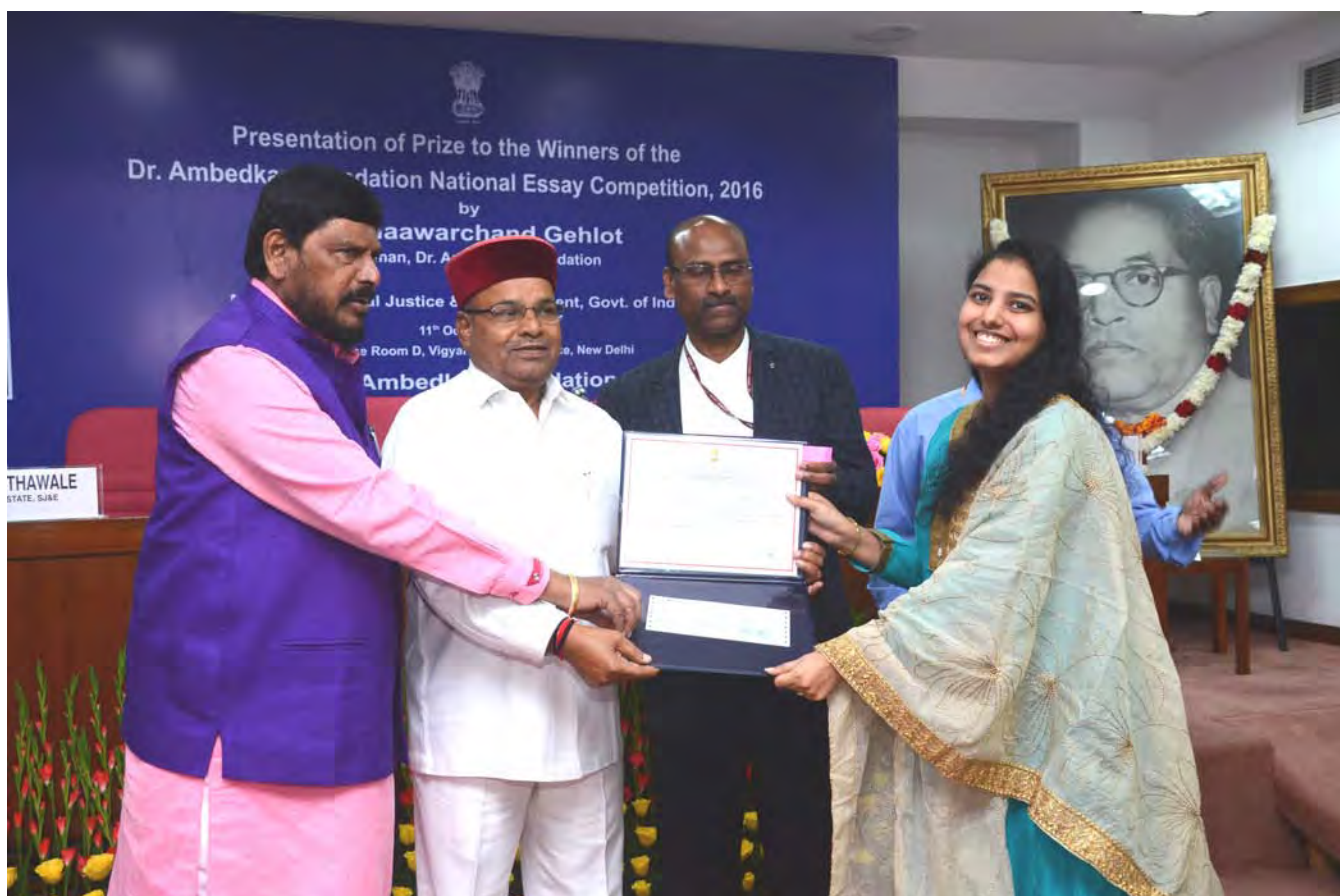
Hon'ble Minister Shri Thaawarchand Gehlot along with MOS Shri Ramdas Athawale, presenting the certificate to the winner of Essay Competition organised by DAF on 11.10.2017, New Delhi

relating to Construction of Hostels (iii) Schemes relating to Coaching of the students, schemes of economic empowerment of these target groups include (i) Loans at concessional rates of interest (ii) Micro credit and (iii) Skill development. The schemes aiming towards social empowerment of the target groups include (i) Curbing practice of untouchability, discrimination & atrocities (ii) Support to NGOs working for target groups like SCs and OBCs (iii) Recognition through National awards etc. The schemes being implemented for the social defence are mainly for Senior Citizens, and victims of Substance (Drug) Abuse and Alcoholism. The policy and schemes for transgenders and Beggars are also under formulation. The scheme-wise distribution of funds among the schemes are given at the Annexure 3.1