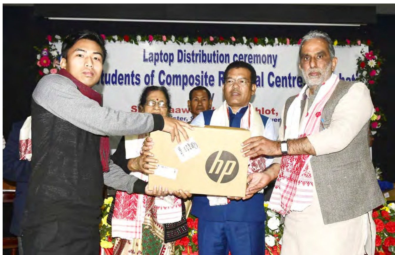
Beneficiary of Skill Development Programme