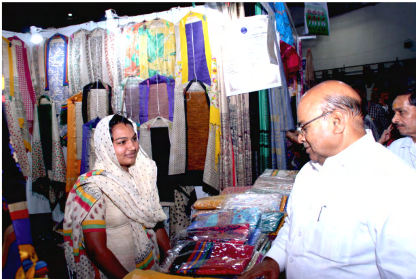
Shri Thaawarchand Gehlot, Hon'ble Union Minister (SJ&E) interacting with beneficiary during IITF at Pragati Maidan, New Delhi.

Assistance: Reimbursement of expenditure for holding job fair by the State Channelizing Agencies / Training institutes up to Rs 50000/- per job fair.