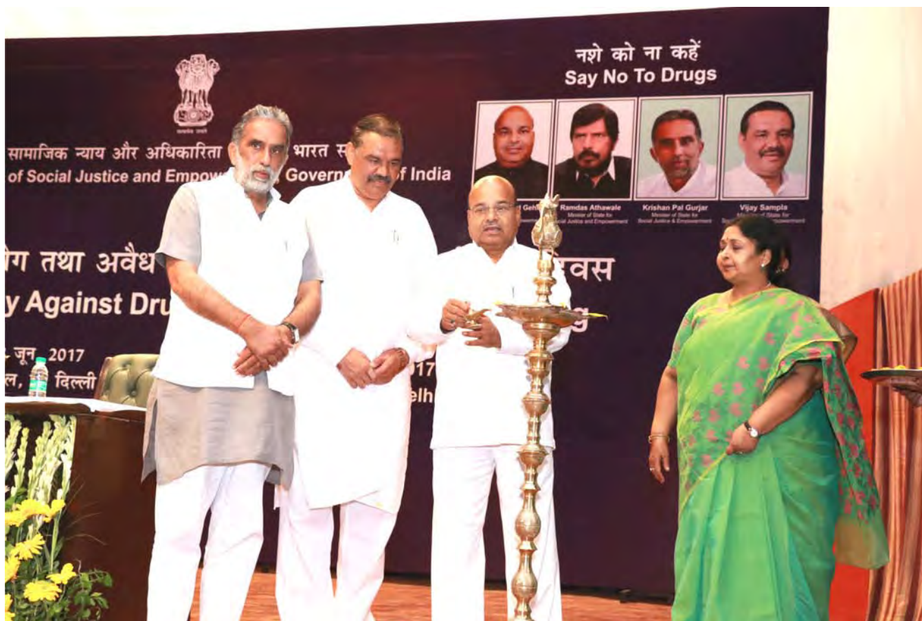
International Day Against Drug Abuse And Illicit Trafficking 28 June, Mavalankar Hall, New Delhi