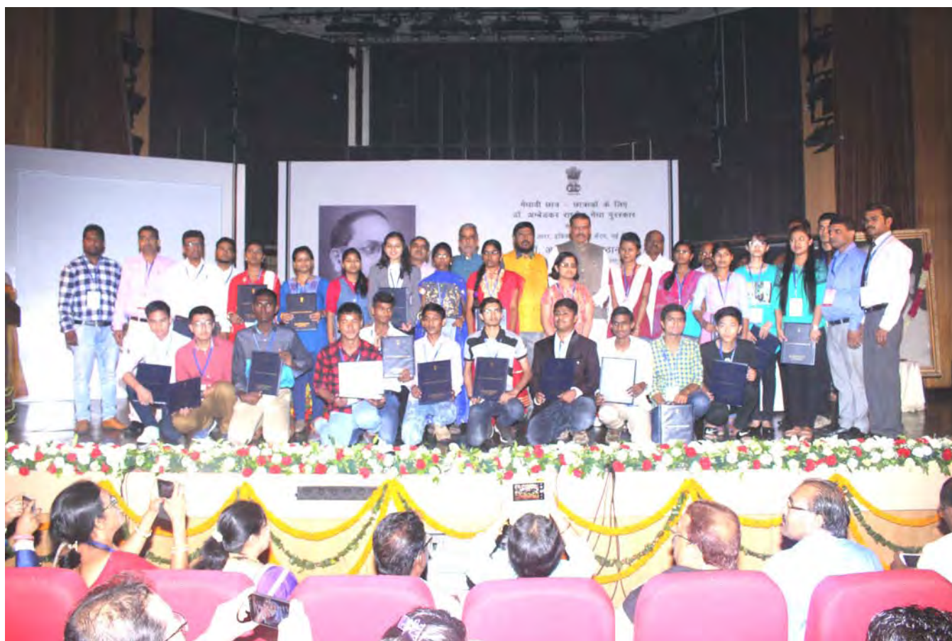
Hon'ble Minister of State for Social Justice & Empowerment, Shri Krishan Pal Gurjar, Hon'ble Minister of State for Social Justice & Empowerment, Shri Vijay Sampla and Hon'ble Minister of State for Social Justice & Empowerment, Shri Ramdas Athwale during the Merit Award presentation ceremony held on 18.04.2017 at India Habitat Center, New Delhi.

The coins with commemorative denomination of Rs. 125/- has a diameter of 44 mm, weight 35 grams and made up of an alloy of 50% Silver,