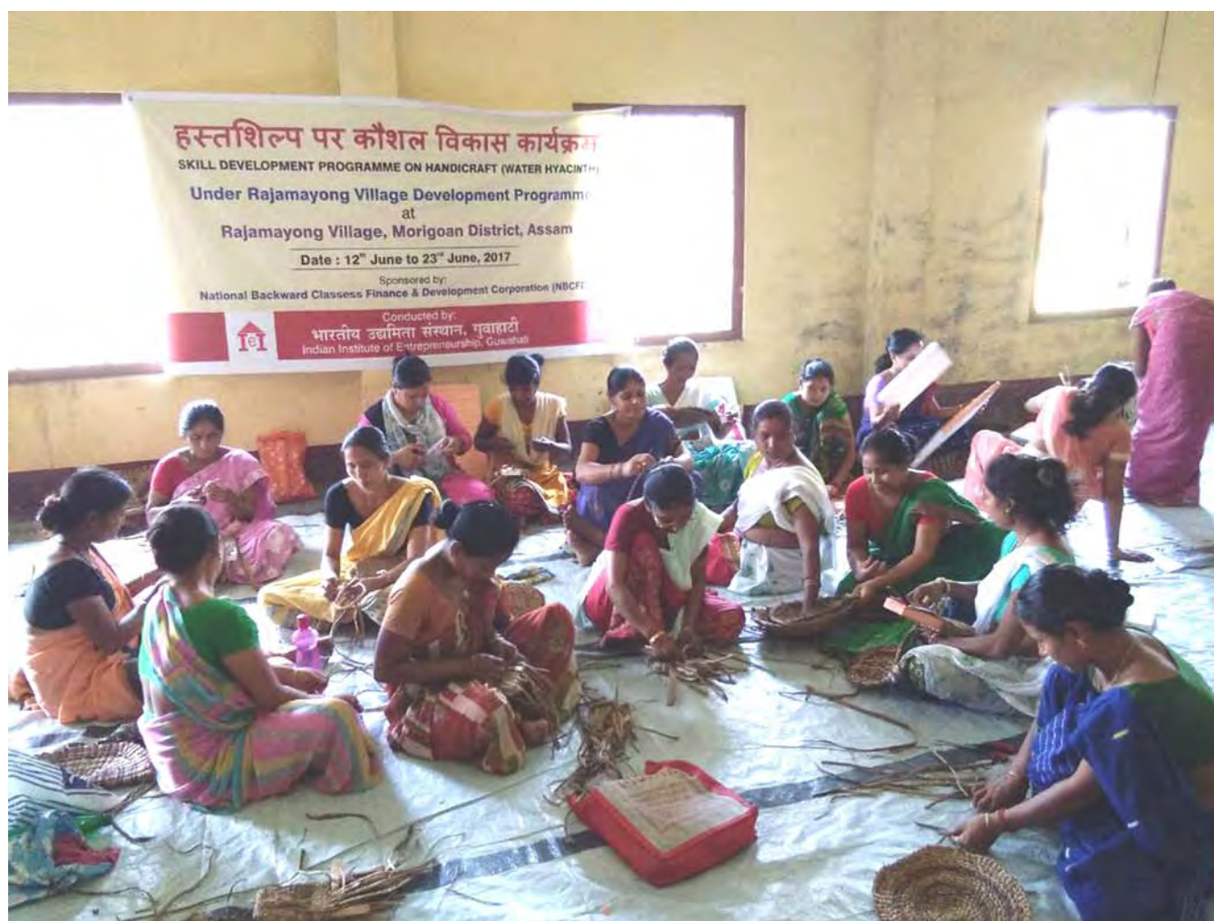
Training of Women Beneficiaries

Credit based Schemes: Financial & Physical Progress during the last two financial years and current financial year (as on 31.12.2017) of Credit based schemes is given in Table 9.9