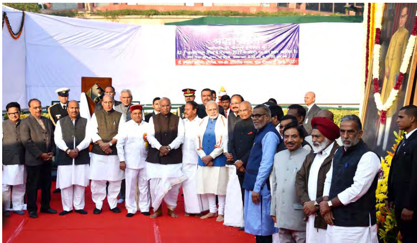
Mahaparinirvan Diwas of Dr. B.R. Ambedkar on 06.12.2017.

The Prime Minister Shri Narendra Modi inaugurated the “Dr. Ambedkar International Centre” at 15, Janpath, New Delhi On December 7, 2017. He had laid the foundation stone of this Centre in April 2015. The Prime Minister unveiled the statue of Dr. B.R. Ambedkar in the lawns and another statue of Dr. Ambedkar in the atrium of the Centre. Union Minister for Social Justice and Empowerment Shri Thaawarchand Gehlot, Ministers of State for Social Justice and Empowerment Shri Krishan Pal Gurjar, Shri Ramdas Athawale, Shri Vijay Sampla, Minister of State for Parliamentary Affairs & Statistics and Programme Implementation Shri Vijay Goel, Secretary of Ministry of Social Justice and