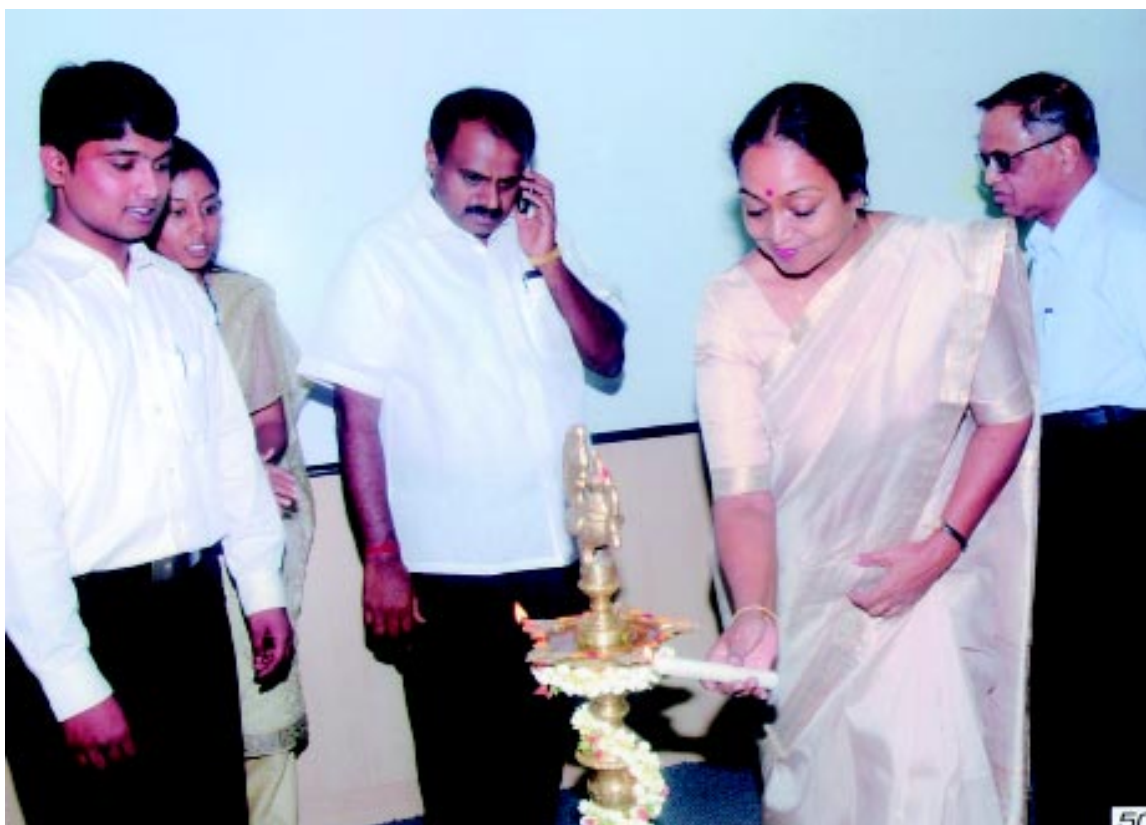
Hon'ble Minister of Social Justice and Empowerment, Smt. Meira Kumar lighting the lamp to inaugurate the STP graduation ceremony on 23rd June, 2007 at IIIT, Bangalore in the presence of Shri S.D. Kumaraswamy, Chief Minister, Karnataka and Shri N.R. Narayanmurthy, Chairman, Infosys.

3.10 Under the 'Scheme of National Overseas Scholarships for SCs etc. candidates assistance is provided to selected Scheduled Castes etc. students for pursuing higher studies of Master level courses and Ph.D programmes abroad in specified field of Engineering, Technology and Science only. The rate of annual maintenance allowance is US $ 14000 per student in USA and other countries and Great Britain Pound (GBP) £ 9000 per student in UK. The annual contingency allowance for books/essential apparatus/study tour/typing and binding of thesis etc. is US $ 1375 for students in USA and other countries and GBP £ 1000 for students in UK. The incidental journey allowance is US $ 17/- or its equivalent in Indian Rupees and the equipment allowance is Rs. 1200/-. The scheme also provides for fees charged by institutions as per actual, passage visa fee and insurance premium etc. The awardees are permitted