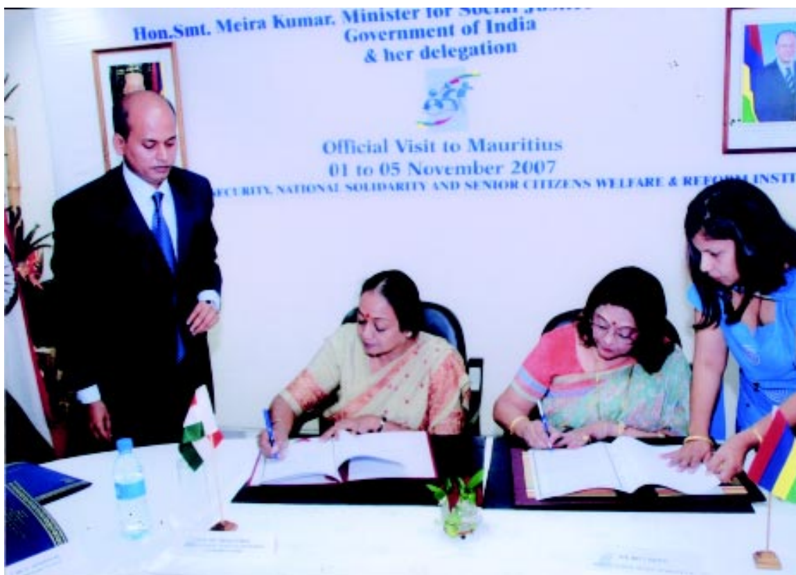
Hon'ble Minister of Social Justice and Empowerment, Smt. Meira Kumar and Mrs. Sheilabai Bappoo, Minister of Mauritius signing the MOU between India and Mauritius at Renganaden Seeneevassen on 3.11.2007.

adequate medical facilities to older persons and take steps to ensure protection of their life and property. There is also a provision for setting up of atleast one old age home for a minimum of 150 beneficiaries in each district by the concerned State Government UT.