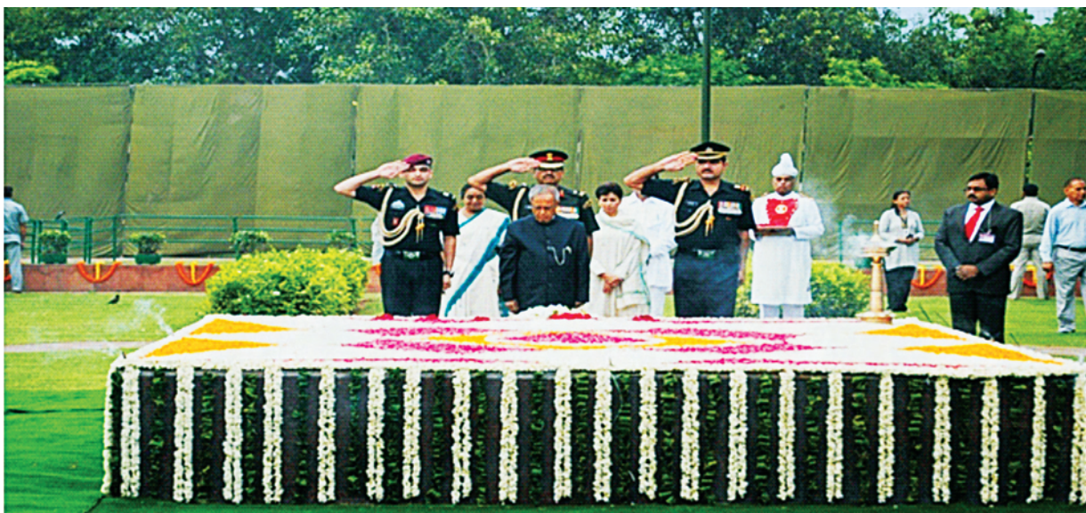
H.E. President of India Shri Pranab Mukherjee; Hon'ble Speaker Lok Sabha; Smt. Meira Kumar; Hon'ble Minister Social Justice & Empowerment, Kumar Selja paying homage to Babu Jagjivan Ram at Samta Sthal, the Samadhi of Babuji at New Delhi on his Death Anniversary on 06.07.2013.