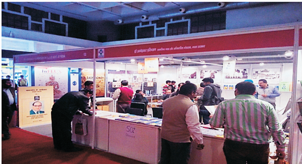
Stall of Dr. Ambedkar Foundation at World Book Fair at Pragati Maidan, New Delhi held from 15 th to 23 rd February, 2014.