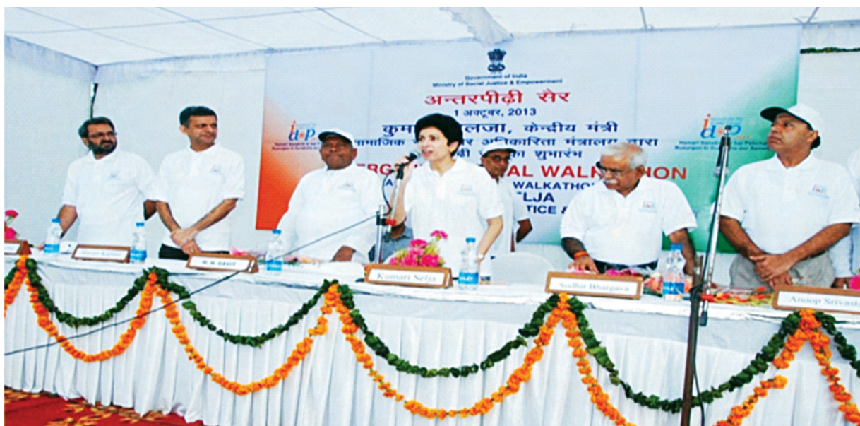
Minister of Social Justice & Empowerment, Kumari Selja addressing the Inter-Generational Walkathon at India Gate on 1 st October 2013

Ministry of Social Justice and Empowerment being the nodal Ministry for the welfare of senior citizens observed the International Day of Older Persons on 1 st October, 2013 at the national level with a series of programmes which include organizing an inter-generational walkathon at the India Gate lawns, New Delhi, and felicitating “Vayoshrestha Sammans” – National Award for Senior Citizens under different categories by the Hon'ble President of India later. State Governments were also requested to observe this occasion in befitting manner right up to the Block levels. On 1 st October 2013, the Ministry also organised similar Walkathons in 9 States in collaboration with Help Age India, namely, Assam (Guwahati), Gujarat (Ahmadabad), Himachal Pradesh (Shimla & Solan), Kerala (Kochi), Madhya Pradesh (Bhopal), Maharashtra (Mumbai), Odisha (Bhubaneswar), Rajasthan (Jaipur) and Tamil Nadu (Chennai), and the Union Territory of Chandigarh.