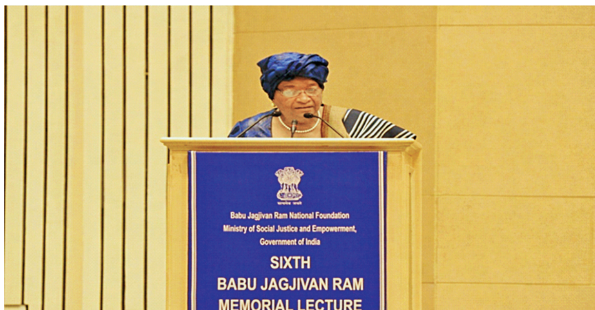
Her Excellency, Ms Ellen Johnson Sirleaf, President of the Republic of Liberia & Nobel Laureate – Peace-2011, delivering the Babu Jagjivan Ram Memorial Lecture at Vigyan Bhawan, New Delhi on 12.09.2013.