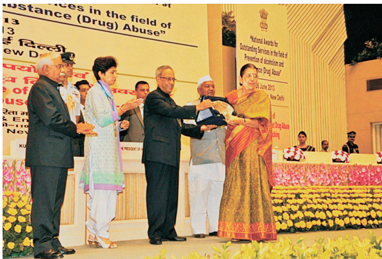
Shri Pranab Mukherjee, Hon'ble President of India, conferring National Award to an awardee during the Function. Kumari Selja, Hon'ble Minister of Social Justice and Empowerment, Shri M H Gavit, Minister of State for Social Justice and Empowerment and Shri Sudhir Bhargava, Secretary, Department of SJ&E are on the Dias.