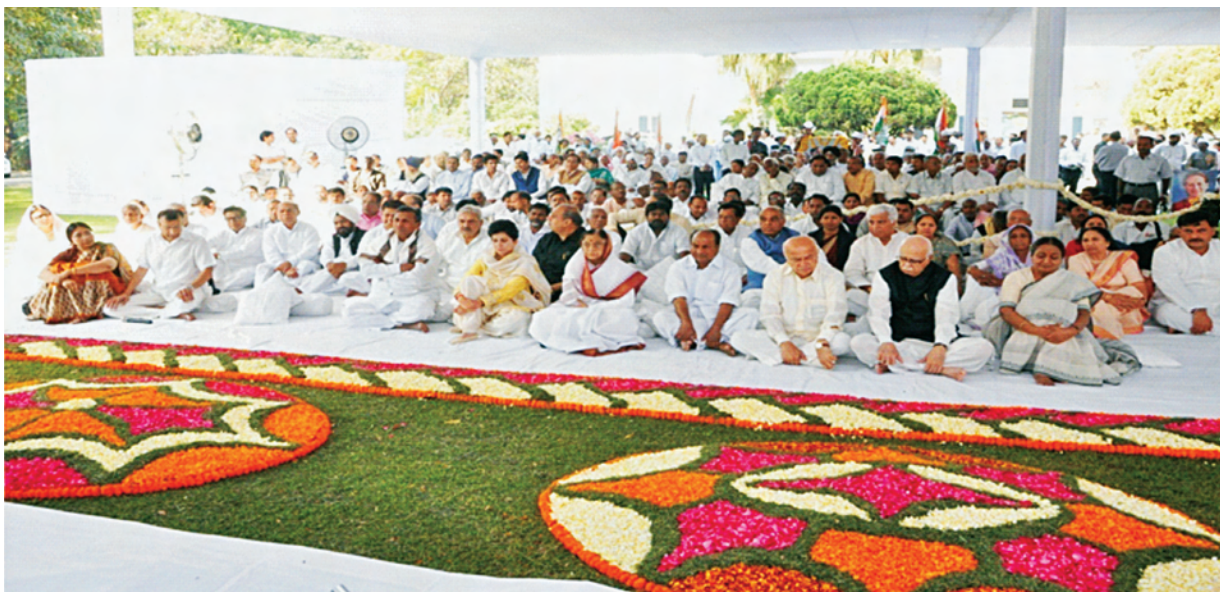
Hon'ble Speaker Lok Sabha; Smt. Meira Kumar, Hon'ble Minister of Defence; Shri A.K. Antony, Hon'ble Minister of Home Affairs, Shri Sushil Kumar Shinde, Hon'ble Minister SJ&E/ President, BJRNf; Kumari Selja, Hon'ble Ex. President of India; Smt. Pratibha Devisingh Patil, Hon'ble Ex. Dy. Prime Minister of India; Shri L.K. Advani and other distinguished dignitaries in Sarva Dharma Prarthana Sabha at 6, Krishna Menon Marg, New Delhi on the Birth Anniversary of Babu Jagjivan Ramji on 05.04.2013.