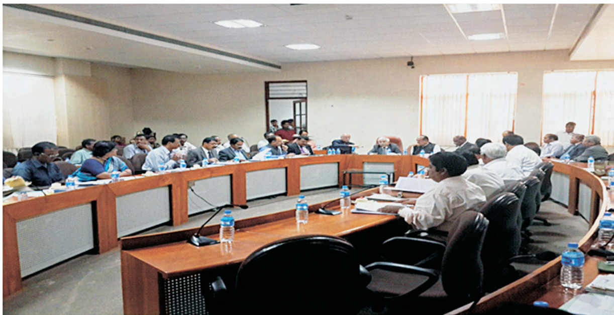
A meeting was held under the chairmanship of Secretary, with the Pr. Secretaries/Secretaries of the Government of Karnataka to review the action taken for implementation of the 'Prohibition of Employment as Manual Scavengers and their Rehabilitation Act, 2013'